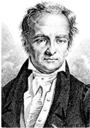
L.A.G. Bosc d'Antic