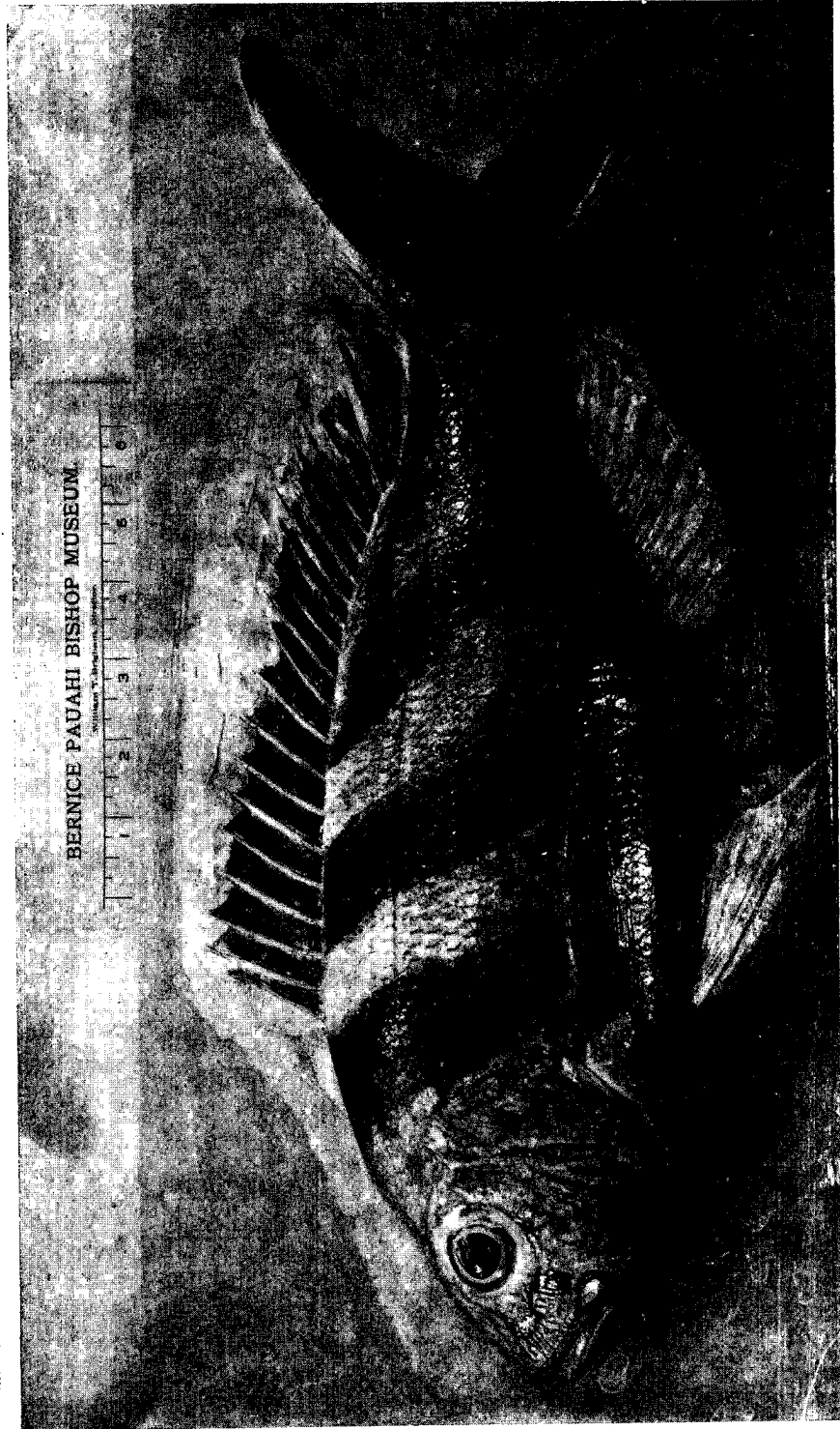
FIG. 3. SERRANUS BRIGHAMI SP. NOV.