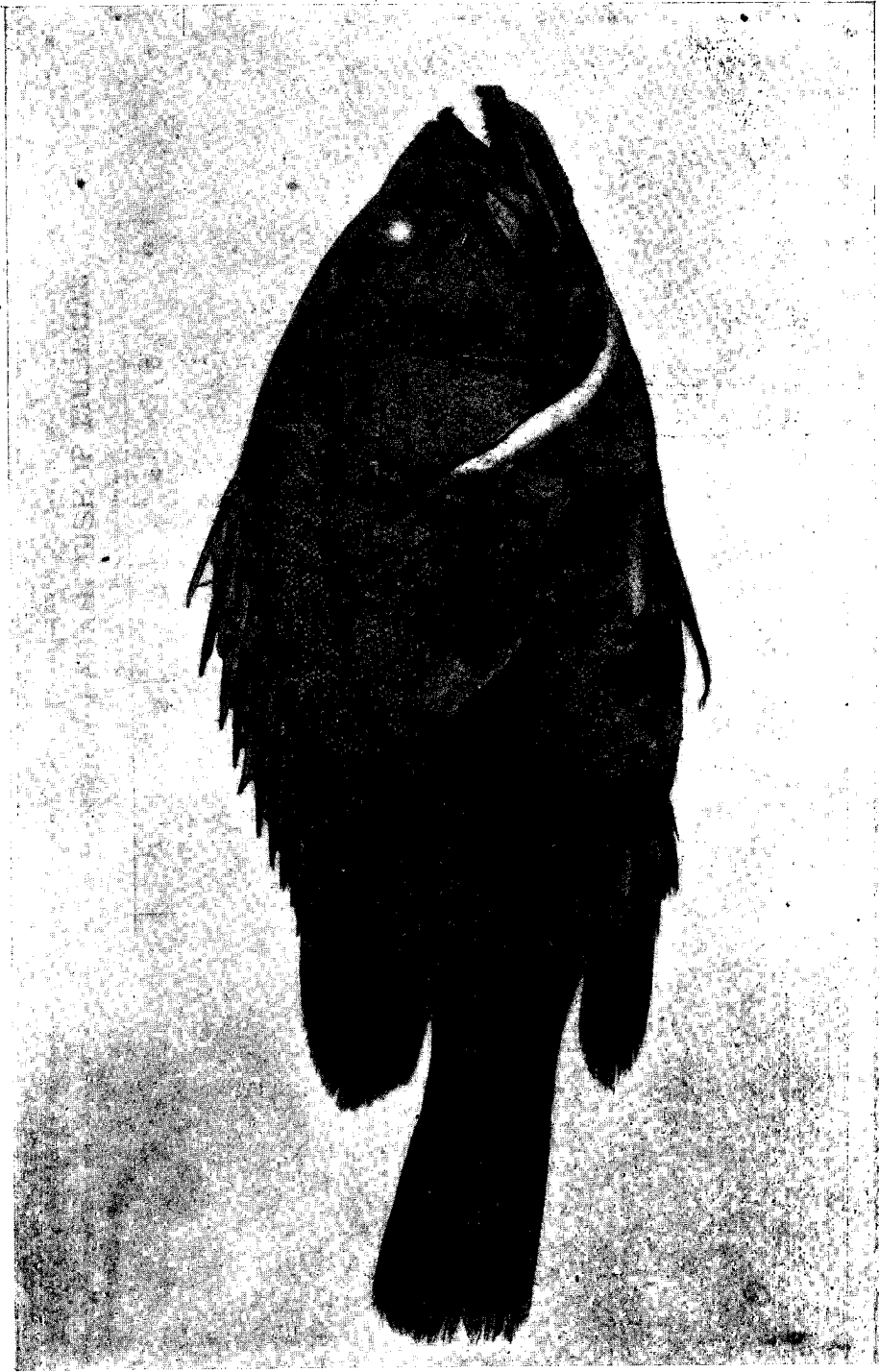
FIG. 1. EPINEPHELUS QUERNUS SP. NOV.