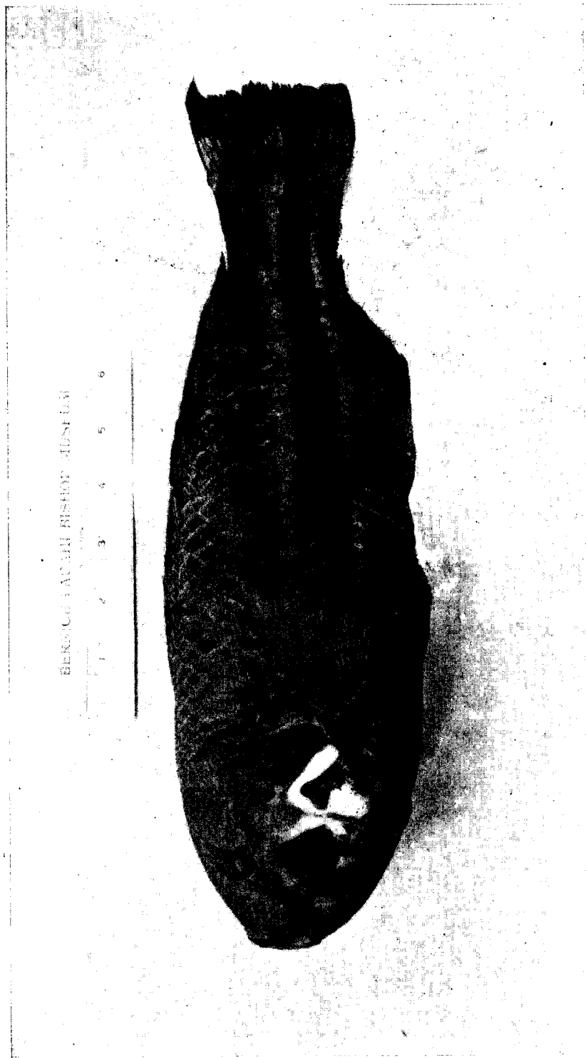
FIG. 7. THALASSOMA BERENDTI SP. NOV.