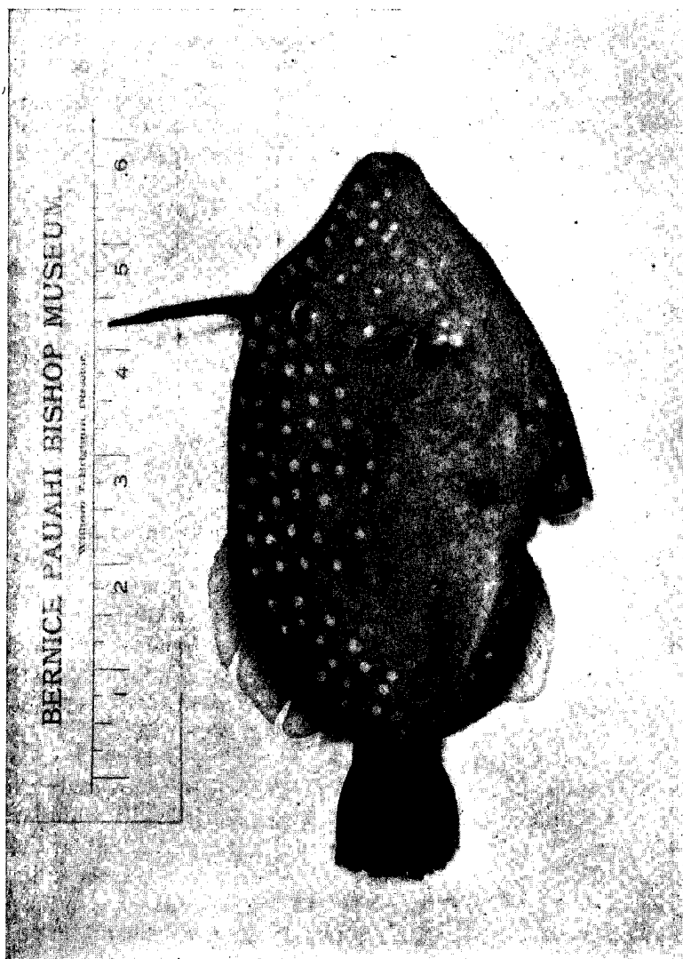
FIG. 6. MONOCANTHUS ALBOPUNCTATUS SP. NOV.