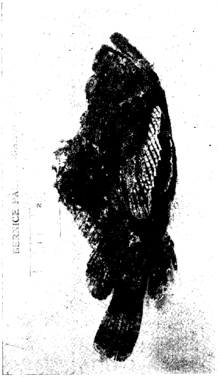
FIG. 5. SCORPAENOPSIS COCOPSIS JENKINS.