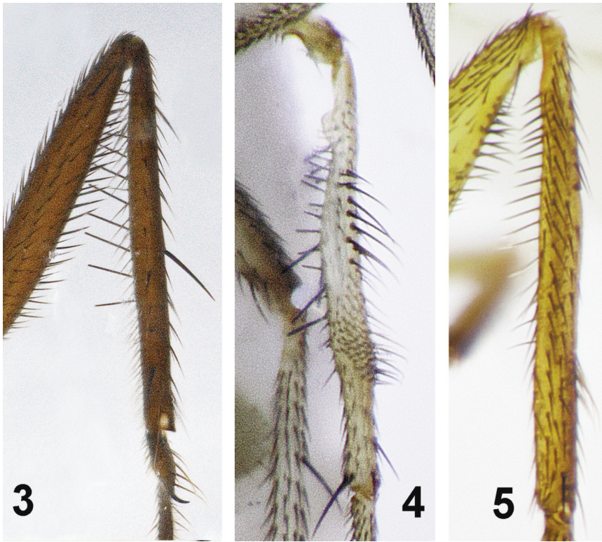
Figs. 3–5. Campsicnemus male mid tibiae. 3. C. kohala , n. sp.; 4. C. marilynæ , n. sp.; 5. C. puuoumi , n. sp.