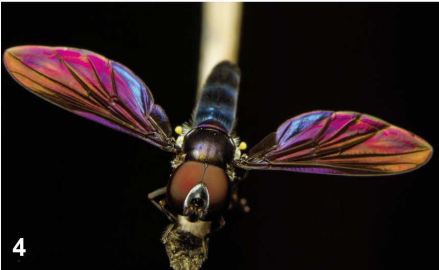
Figures 3–4. Ocyptamus dimidiatus (Fabricius). 3. Live habitus showing characteristic dark infuscated wings. 4. Live habitus showing frontal view of head.

This marks the first record of the species in Hawai‘i and the furthest west the species has been found in the United States. Given the apparent recent introductions of it into a number of areas outside of its native range, it may spread easily and in the future be found on other Hawaiian Islands and possibly other Pacific islands.