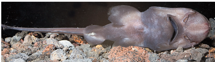
Figure 4. Ventral view of Hawai'i catshark (BPBM 40879).

a specimen of Apristurus fedorovi collected from the Emperor Seamount chain (38°46' N, 171°11'E) (Dolganov, 1985; Nakaya & Shirai, 1992). The Emperor Seamounts are the northern part of what is considered to be the Hawaiian-Emperor seamount chain and continue northward from the Hawaiian Archipelago for an additional 2,300 km (Clague & Dalrymple, 1989; Mundy, 2005). Both A. spongiceps and A. fedorovi belong to the “ spongiceps group” (Nakaya & Sato, 1999).