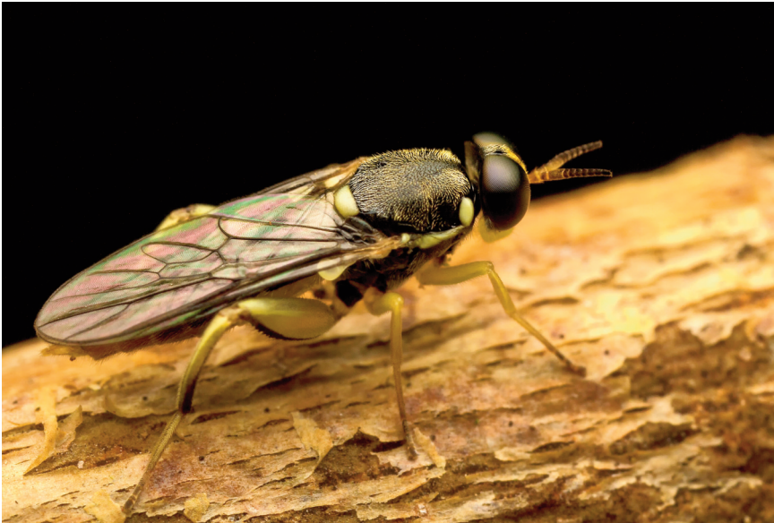
Fig. 2. Solva sp., female, dorsolateral view showing wing venation and thoracic vestiture.

black on basal half; hind femur swollen, finely punctate, with broad shining black stripe lateroventrally along entire length, with short black denticles ventrally, hind tibia curved, yellow basally, brownish black on apical one-third, tarsomeres as in fore and mid legs, claws black.