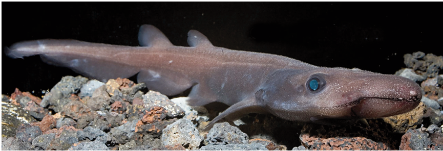
Figure 3. Lateral view of Hawai'i catshark (BPBM 40879).