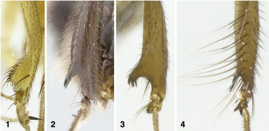
Figs. 1–4. Campsicnemus ridiculus species group, apices of mid tibiae, showing subapical processes. 1. C. konahema , n. sp. 2. C. miritibialis Van Duzee. 3. C. ridiculus Parent. 4. C. ridiculoides Evenhuis, n. sp.