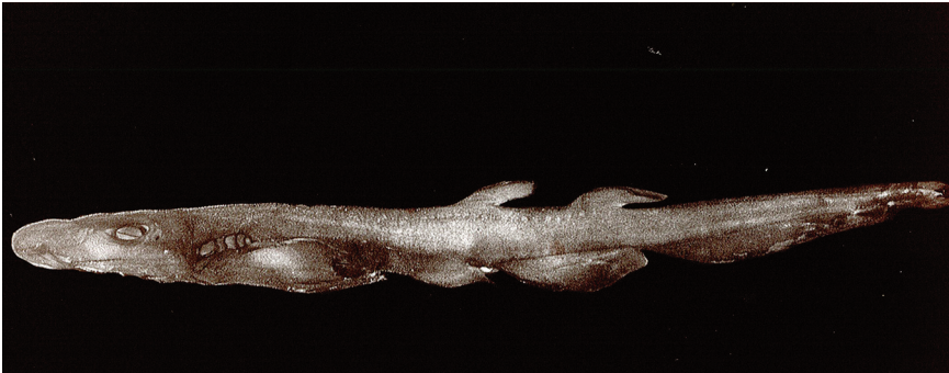
Figure 2. Hawai'i NELHA catshark specimen (BPBM 40879) immature male 174 mm TL.