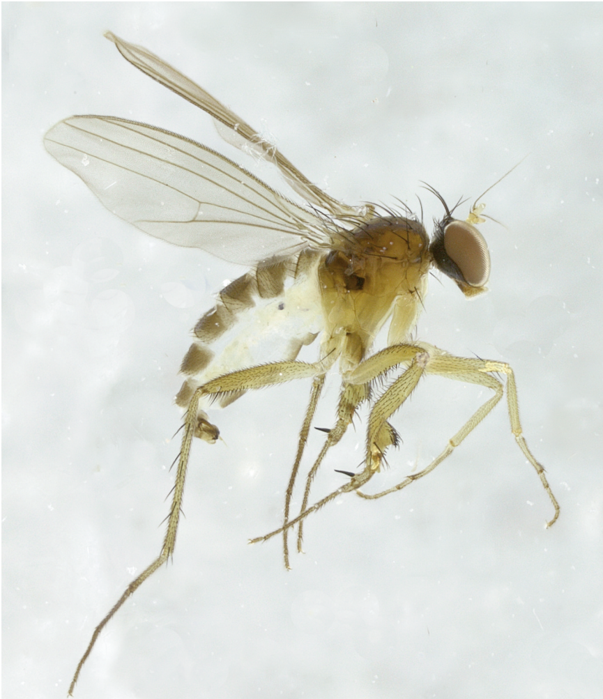
Fig. 5. Campsicnemus konahema Evenhuis, n. sp. holotype male, habitus.