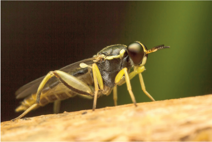
Fig. 1. Solva sp., female, anterolateral view showing detail of head and legs.

brownish black, yellowish mesally, flagellomeres 2–8 black, segments 2–5 yellowish brown mesally at base; hair of scape and pedicel blackish with some pale hairs ventrally, longest dorsolaterally; palpus yellowish white to yellow, second segment linear-ellipsoid, about 3.5 times as long as first; both palpal segments with pale hairs, second segment bare apically; proboscis yellowish brown to yellow.