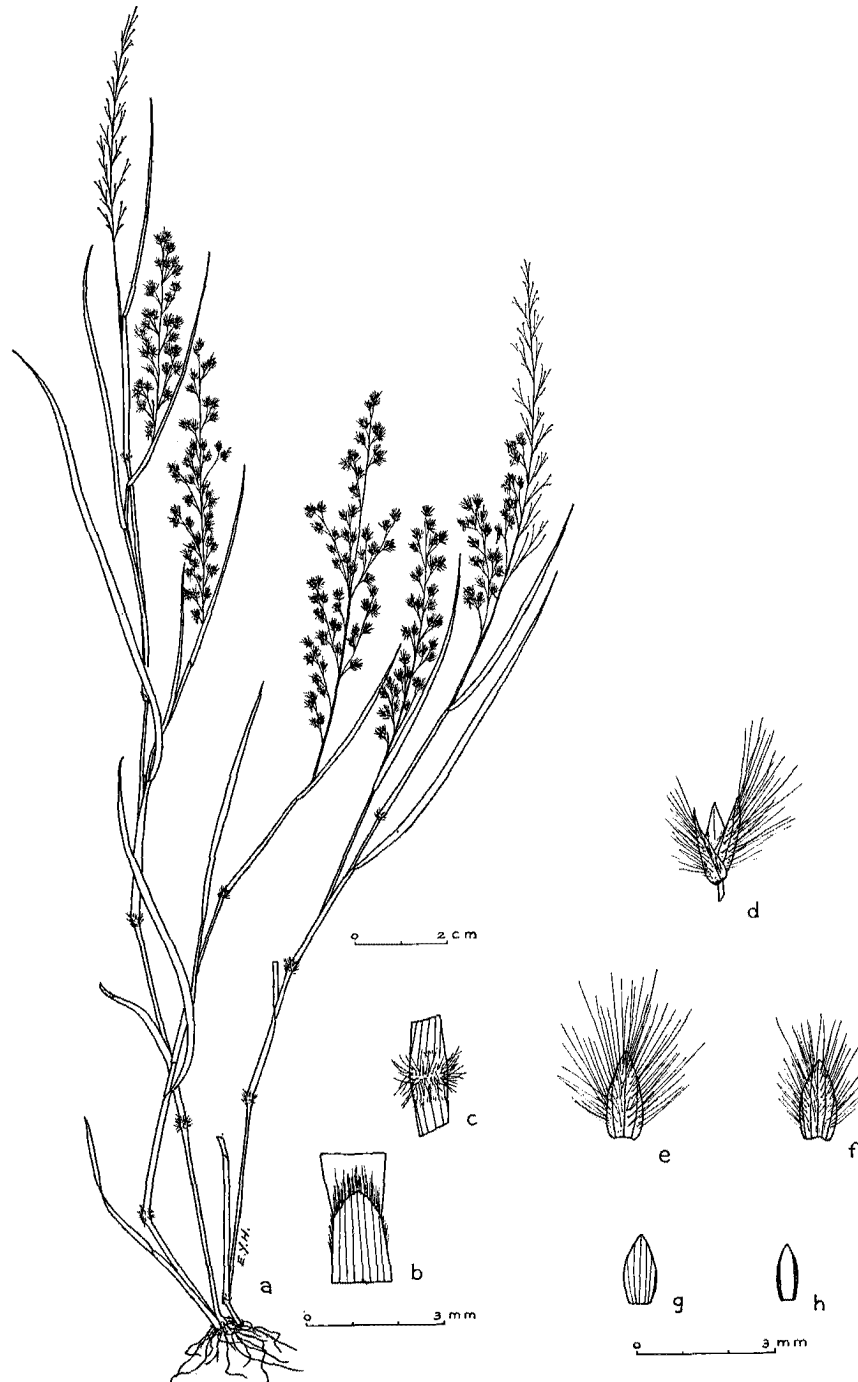
FIGURE 1.— Panicum konaense : a, habit; b, ligule; c, node; d, spikelet; e, first glume, dorsal view; f, second glume, dorsal view; g, sterile lemma, dorsal view; h, floret.