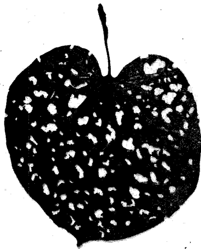
FIGURE 1.—Leaf of Piper from Mount Teape, Rurutu, showing the characteristic work of R. excavatus , new species. About one third natural size.

the second and third, third and fourth quite broad as a result of the strongly reflexed abdomen, the epipleurae behind also greatly lobed. Male, length 10 mm, breadth 4 mm; female, length 11 mm, breadth 4.75 mm.