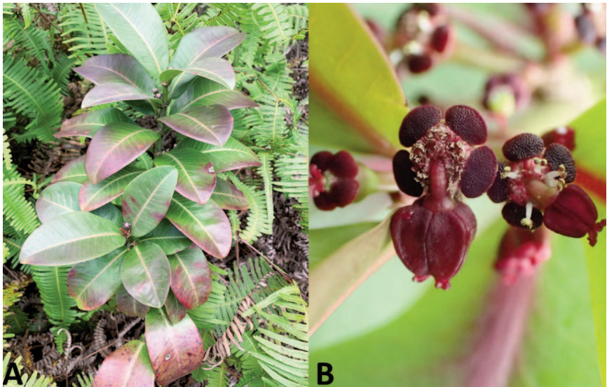
Figure 4. Euphorbia remyi var. remyi . A. Low shrubby habit. B. Cyathia with glabrous capsules, headwaters of Lumaha'i River, Kaua'i, 18 May 2017, Wood et al. 17413 (BISH, PTBG, US).