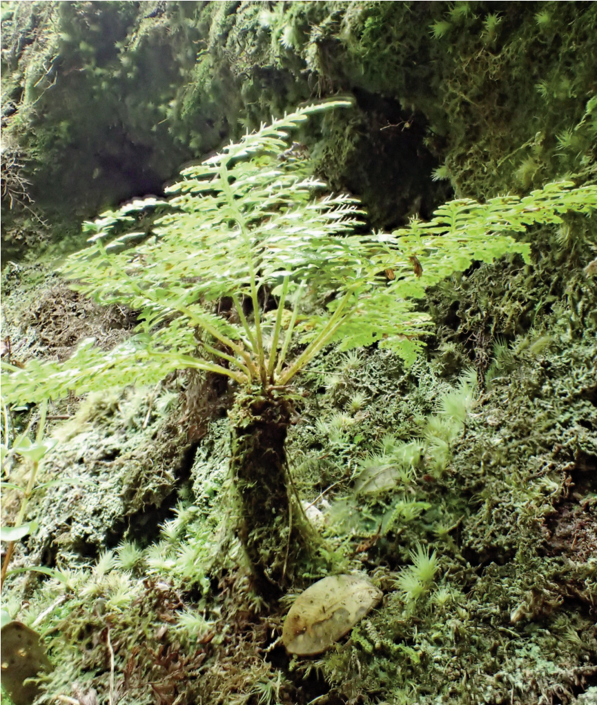
Figure 1. Athyrium haleakalae , fertile along headwater drainage of Wai‘alae, Kaua‘i, 7 Aug 2019, Wood, Walsh & Perlman 18272 (BISH, NY, PTBG, UC, US).

blade 3.5–9.0 cm long \times 1.5–3.0 cm wide, lanceolate, single colony of ca. 40 plants, sympatric with Athyrium microphyllum , 1,170 m elev., 7 Aug 2019, K.R. Wood, S. Walsh & S. Perlman 18272 (BISH, NY, PTBG, UC, US); loc. cit. , additional small colony, 1,170 m elev., 7 Aug 2019, K.R. Wood, S. Walsh & S. Perlman 18274 (PTBG).