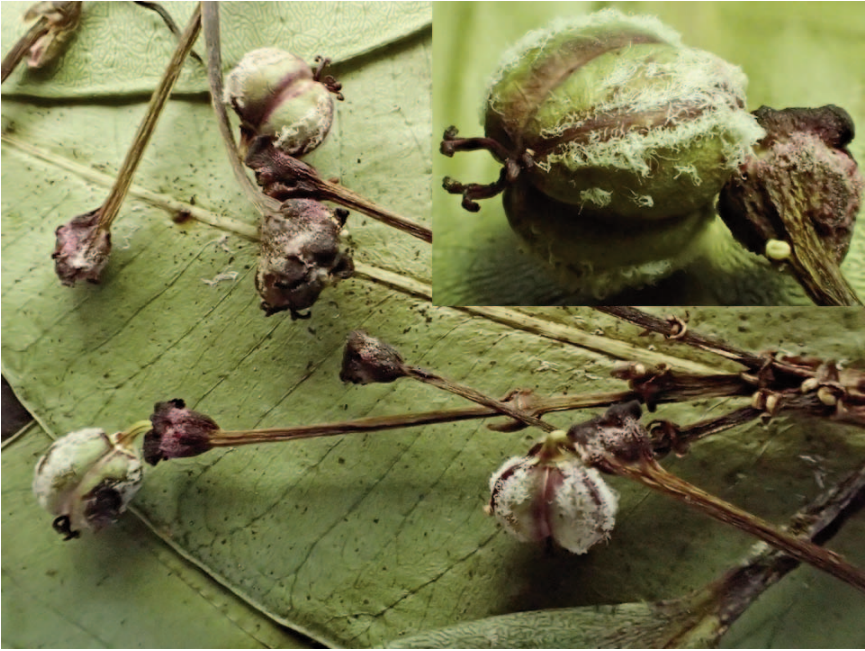
Figure 2. Euphorbia remyi var. hanaleiensis , herbarium specimen, showing branching inflorescence and cyathia with insert showing close-up of diagnostic tomentose capsule, Wainiha, Kaua‘i, 23 Apr 2014, Wood, Perlman & Query 15925 (BISH, CAS, PTBG).