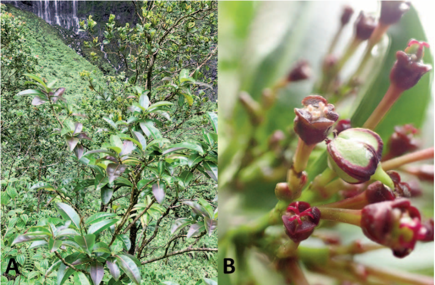
Figure 3. Euphorbia remyi var. kauaiensis . A. Erect tree habit, headwaters of Wailua River, Kaua'i, 29 Sep 2021, Wood, Heintzman & Deans 18814 (PTBG). B. Cyathia with glabrous capsules, loc. cit. , 21 Feb 2017, Wood, Walsh & Perlman 17259 (BISH, CAS, PTBG, US).