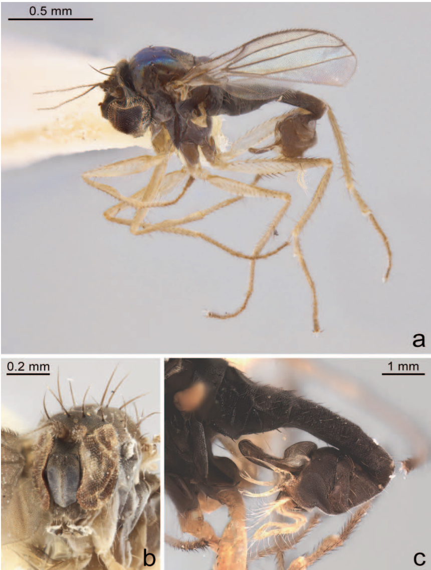
Figure 2. Phacaspis palauensis n. sp. a. male habitus, left lateral; b. female head, anterior; c. male postabdomen, left lateral.

Types. PALAU: Holotype, ♂, paratypes, 3♀, Oreor (= Koror): limestone ridge, 21 Jan 1948, mangrove swamp, Pacific Ent. Survey of Micronesia, H.S. Dybas (USNM); paratype ♂, Koror I., mangroves 24 Apr 1957, C.W. Sabrosky (USNM); paratype ♂, Babelthaup , Melekeiok, 23 May 1957,