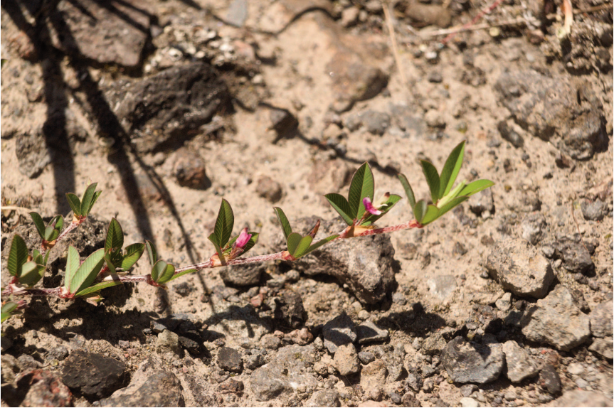
Figure 2. Kummerowia striata as seen at the base of Mauna Loa Strip Road, Hawai‘i Island.