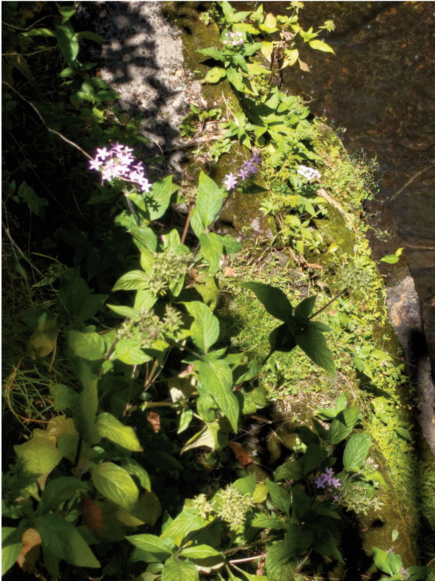
Figure 6. Pentas lanceolata naturalized on a rock wall in Pauoa, O'ahu.

Material examined. O'AHU: Round Top Rd, 200 m mauka of Makiki St, shady roadside, relatively dry, probably persisting from planting, but spreading, many plants seen, 21.310339, -157.830046, 27 May 2022, K. Faccenda 2382.