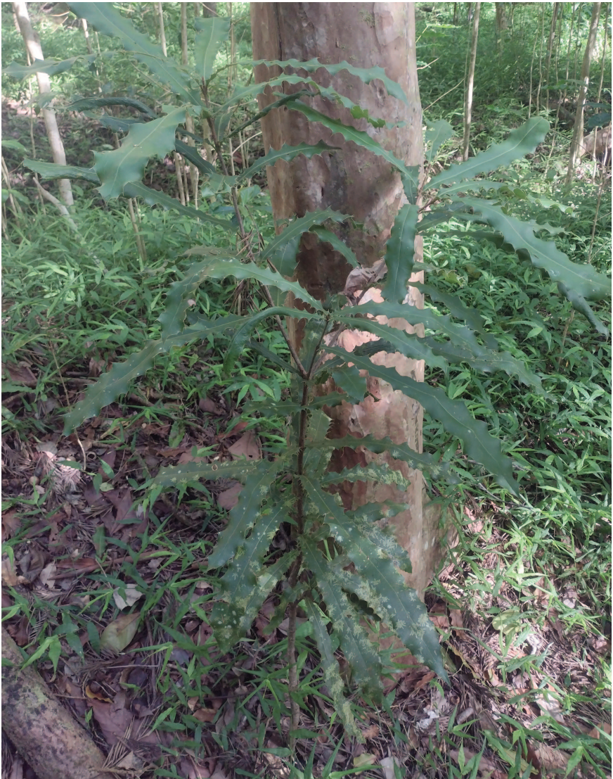
Figure 5. Macadamia tetraphylla seedling along the Pu‘u Kaua Trail, O‘ahu.