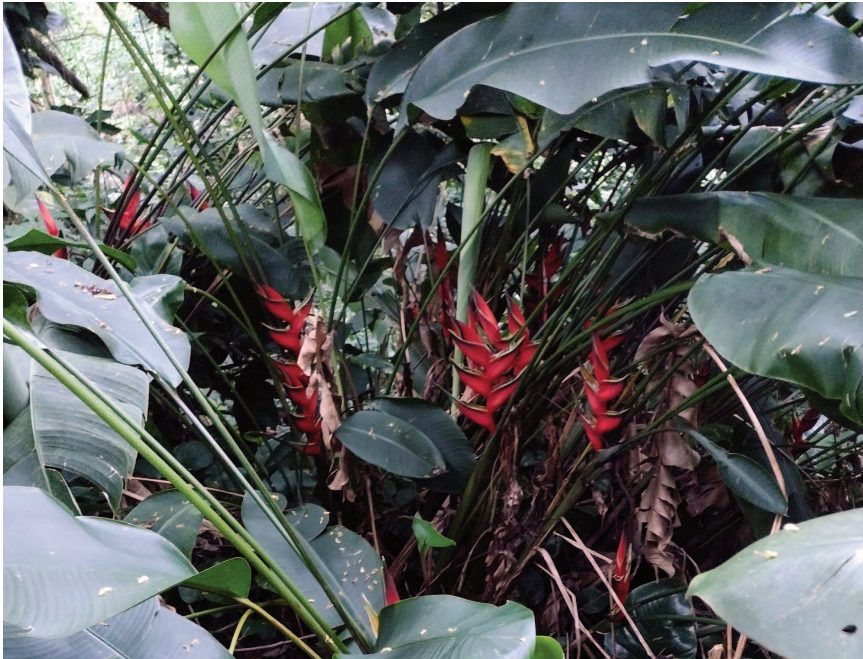
Figure 3. Heliconia bihai naturalized in Kalihi Valley, O‘ahu.