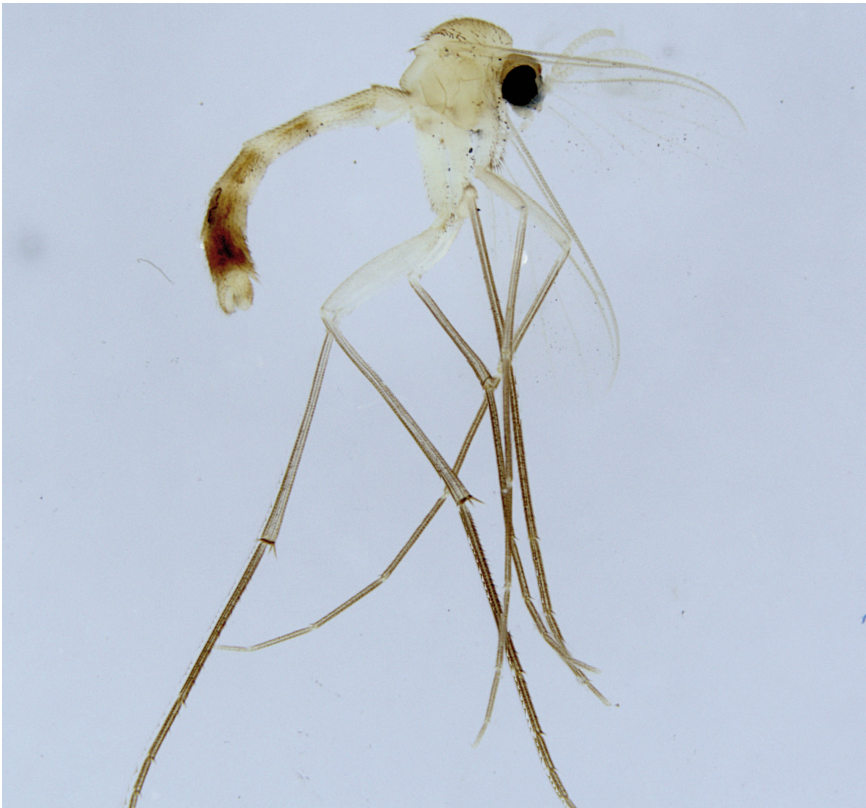
Figure 1. Tylparua troglodytes Evenhuis, n. sp., male habitus lateral.

Description. Lengths: Body: 2.8 mm; wing: 3.0 mm. Male (Fig. 1). Generally white throughout. Head. Occiput and vertex brown. Antennae with flagellum segment 1 longer than wide; segments 2–14 squarish, each successive segment reduced in width apically as antennae slightly tapers to rounded apex. Flagellomeres white.