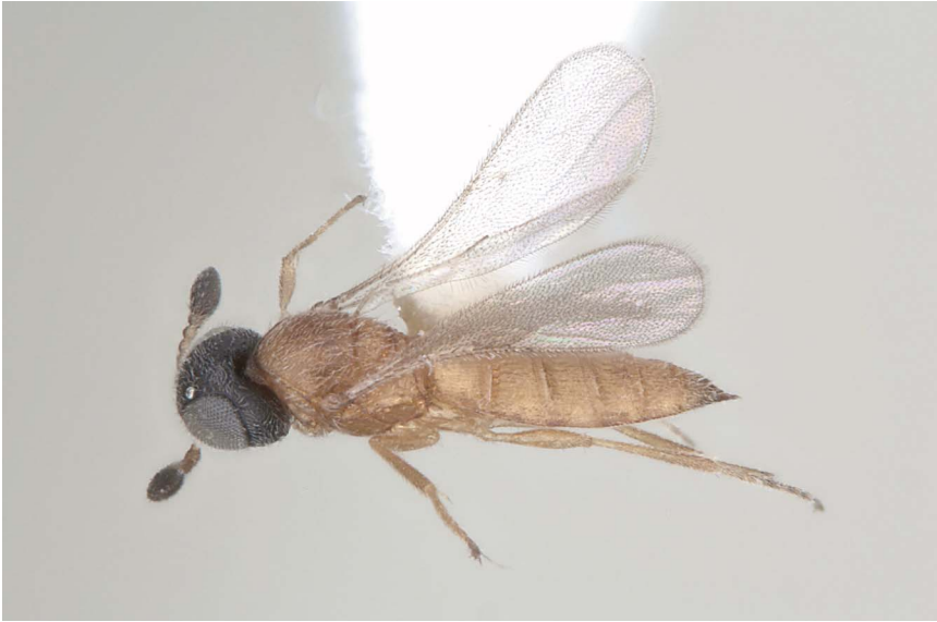
Figure 37. Cremastobaeus sp. (Hymenoptera: Scelionidae).