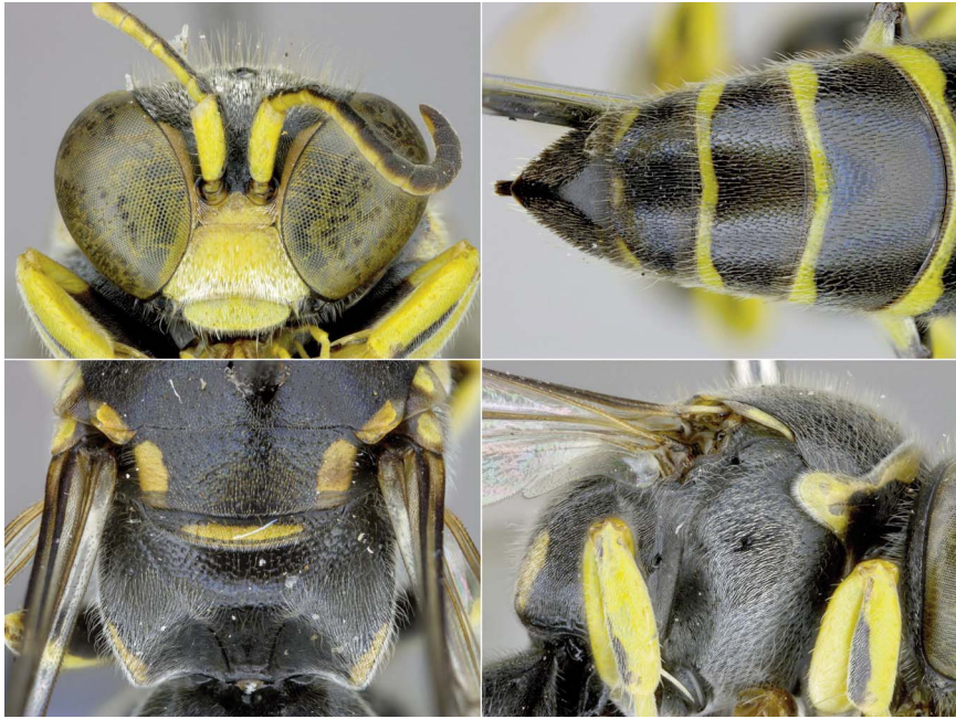
Figure 11. Bembecinus littoralis (Hymenoptera: Crabronidae). Top left: frontal view of head. Top right: dorsal view of apical metasoma. Bottom left: dorsal view of posterior mesosoma. Bottom right: lateral view showing propodeal flange.

The following life history notes were contributed by Paul Krushelnycky. On June 12–13 2024, about 15–20 Bembecinus puparia were collected from a patch of sand at James Campbell NWR, Kahuku, O‘ahu. These were obtained by sifting sand in an area with many nest burrow holes. Each nest consisted of a single cell containing an immature Bembecinus sealed in a capsule. This oblong capsule consisted of many small sand pebbles glued to a dark membrane. The capsule exterior was quite hard and rigid, protecting the developing wasp. Those that were opened contained white pupae with melanized eyes. Attached loosely around the capsule were often wings of cicadellid prey and other debris that was presumably inside the nest burrow prior to pupation. Five adults emerged between June 23 and July 22. Another five apparently entered dormancy and emerged as adults in January and February 2025. Two puparia were found to have small holes in their exterior or were damaged when collected, and when opened fly maggots were observed. These were reared and turned out to be an unidentified phorid.