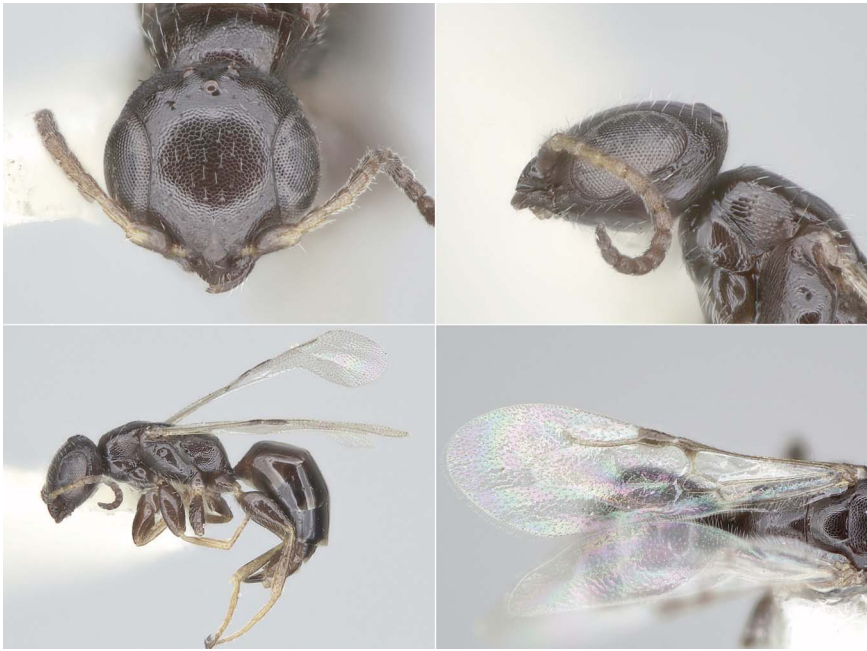
Figure 7. Goniozus gracilicornis (Hymenoptera: Bethyliidae). Top left: dorsal view of head. Top right: lateral view of head. Bottom left: lateral habitus. Bottom right: left fore wing.

Material examined. HAWAII: Waikōloa to ‘Anaeho‘omalua, on Pennisetum setaceum , 20 Nov 1982, W.C. Gagne, 1♀. Pōhakuloa Training Area, Old Saddle Rd, 6,500 ft [1,980 m], 19.7457°N 155.5271°W, on Myoporum , 17 Jun 2012, K.N. Magnacca, 1♀, KNMC. Pōhakuloa Training Area, Kīpuka Kalawamauna, 5,300 ft [1,620 m], 19.7460°N 155.6581°W, sweeping Bidens , 8 Aug 2012, K.N. Magnacca, 1♀. Pu‘u Wa‘awa‘a, West Kīleo, 4,300 ft [1,300 m], 19.7345°N 155.8359°W, beating Santalum , 14 Aug 2012, K.N. Magnacca, 1♂, KNMC.