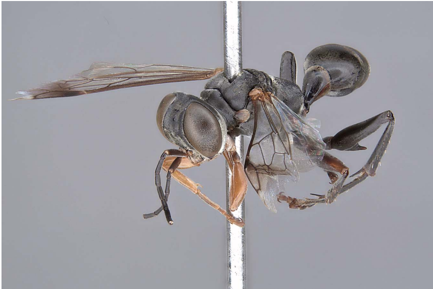
Figure 12. Dicranorhina ritsemae luzonensis (Hymenoptera: Crabronidae), male. Oblique fronto-dorsal view.