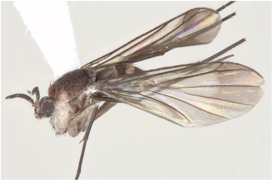
Figure 1. Lyprauta sp. (Diptera: Keroplatidae).

Material examined. KAUA'I: North Bog, on leaves, 22.1631°N 159.5999°W, 1 Aug 2023, K.N. Magnacca, K23080103-06, 1♀. O'AHU: Pauoa Flats, 1600 ft [690 m], 11 Aug 1982, W.D. Perreira, 1♂. Mt. Tantalus, 2000 ft [610 m], flood light, 22 Sep 1984, W.D. Perreira, 1♀. Camp Pūpūkea, 1950 ft [595 m], yellow sticky board trap, 15–28 May 1996, W.D. Perreira, 2♂. Central Kalua'a Gulch, 630 m, Townes Malaise trap, 21.4611°N 158.0995°W, 31 Mar–8 Jun 2023, K.N. Magnacca, O23060801–01, 2♀. MOLOKA'I: Nr. Honomuni Stream, ca. 10 ft [3 m], yellow sticky board trap, W.D. Perreira: 1♂ 2–16 Sep 1994, 1♀ 16–30 Sep 1994. Papi'o Stream, 600 ft [180 m], yellow sticky board trap, W.D. Perreira: 1♀ 14–28 Oct 1994, 1♀ 20 Jan–3 Feb 1995.