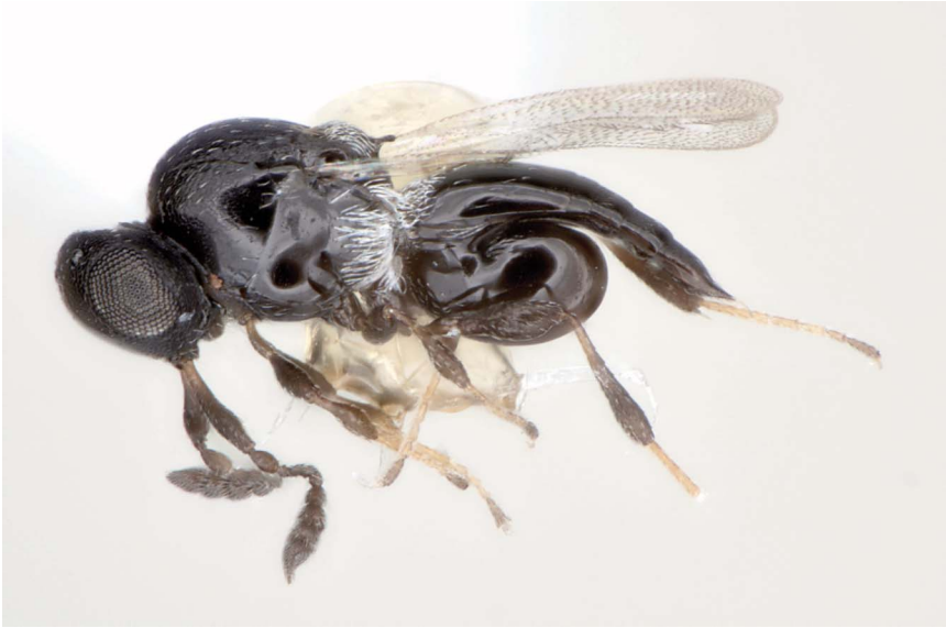
Figure 34. Synopeas nr. curvicauda (Hymenoptera: Platygasteridae).