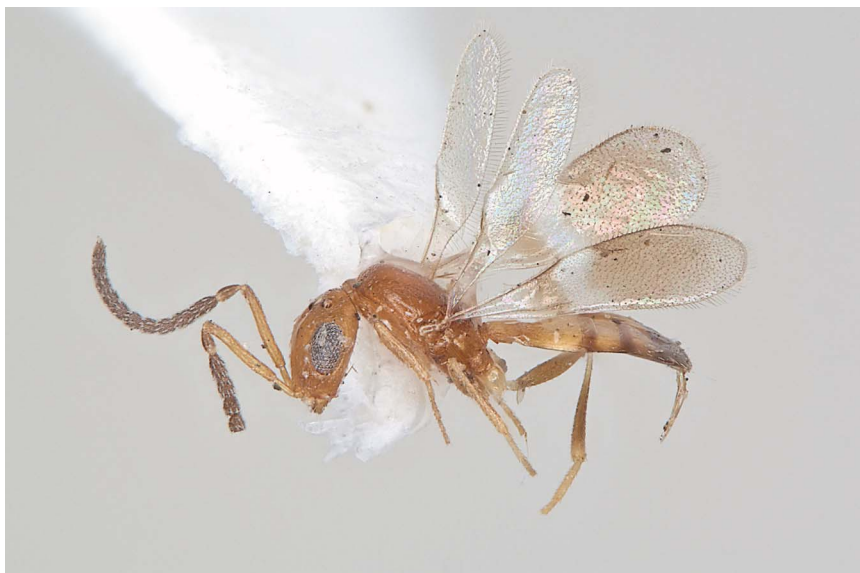
Figure 35. Aradophagus sp. (Hymenoptera: Scelionidae).