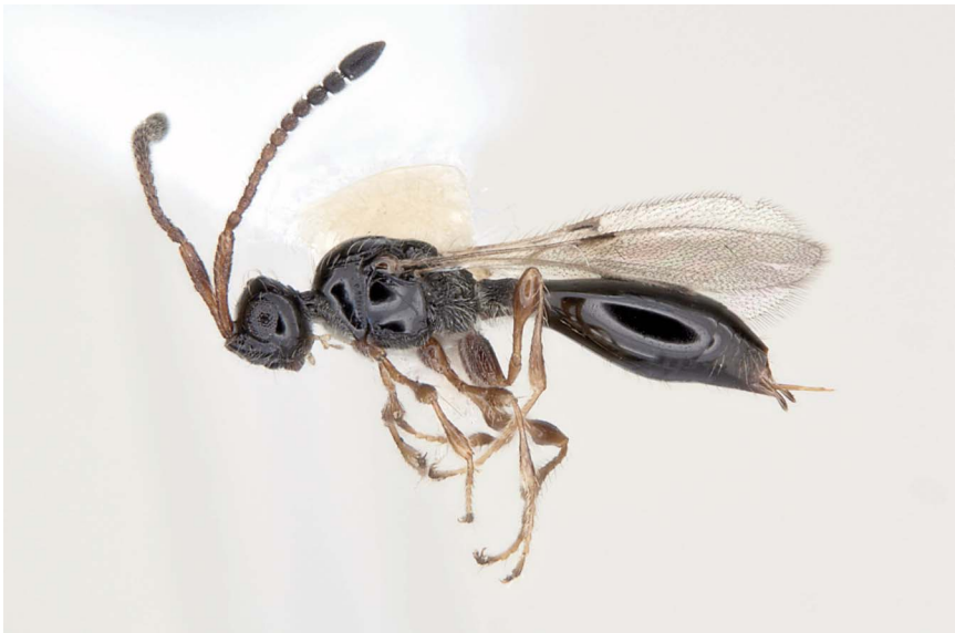
Figure 25. Paramesius sp. (Hymenoptera: Diapriidae).