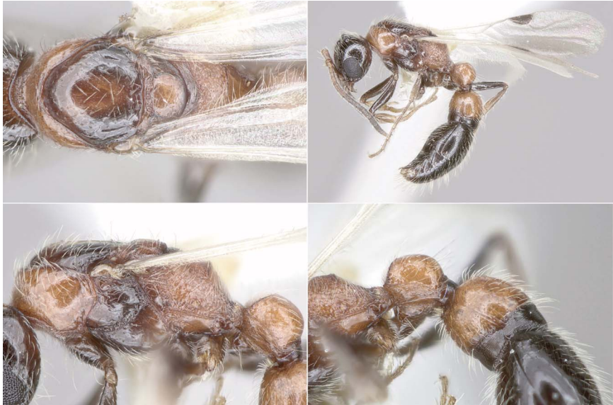
Figure 32. Lioponera sp. (Hymenoptera: Formicidae). Top left: dorsal view of mesosoma. Top right: lateral habitus. Bottom left: lateral view of mesosoma. Bottom right: petiole and anterior gaster.