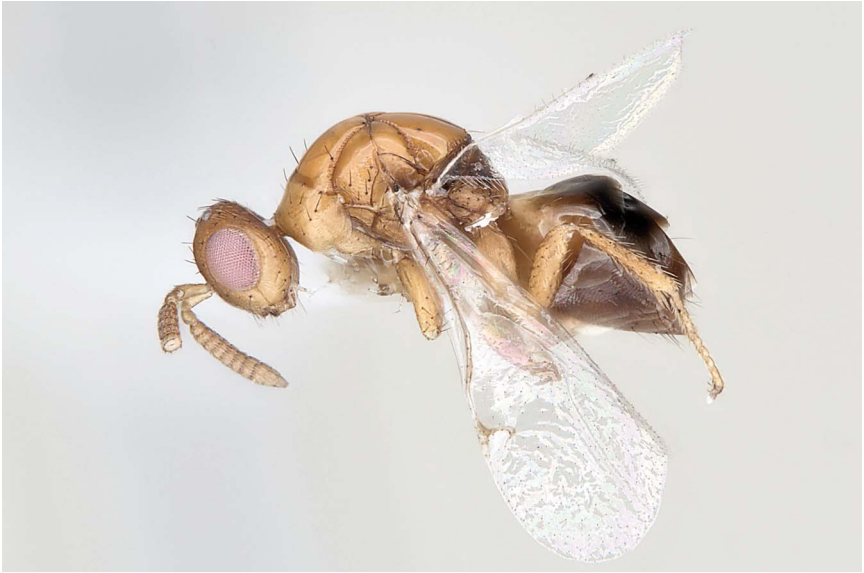
Figure 27. Meselatus bicolor (Hymenoptera: Epichrysomallidae).