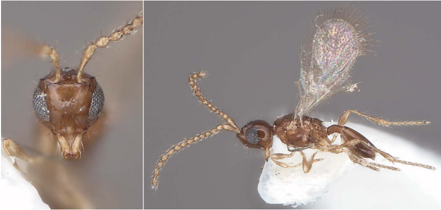
Figure 22. Calogalesus sp. (Hymenoptera: Diapriidae). Left: anteroventral view of head. Right: lateral habitus.