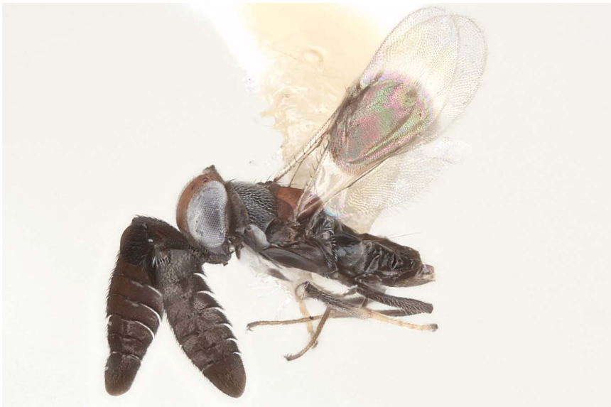
Figure 26. Cryptanusia comperei (Hymenoptera: Encyrtidae).

Material examined. O'AHU: Pahole NAR, bioblitz pan trap 18, 25–27 Mar 2010, 1♀. Palikea, Honouliuli Forest Reserve, beating Cheirodendron trigynum , 19 Oct 2017, K.N. Magnacca, 1♀. Pu'u Hāpapa 815 m, on Psychotria hathewayi , 21.467°N 158.103°W, 17 Jul 2017, O23071708-01, K.N. Magnacca, 1♀.