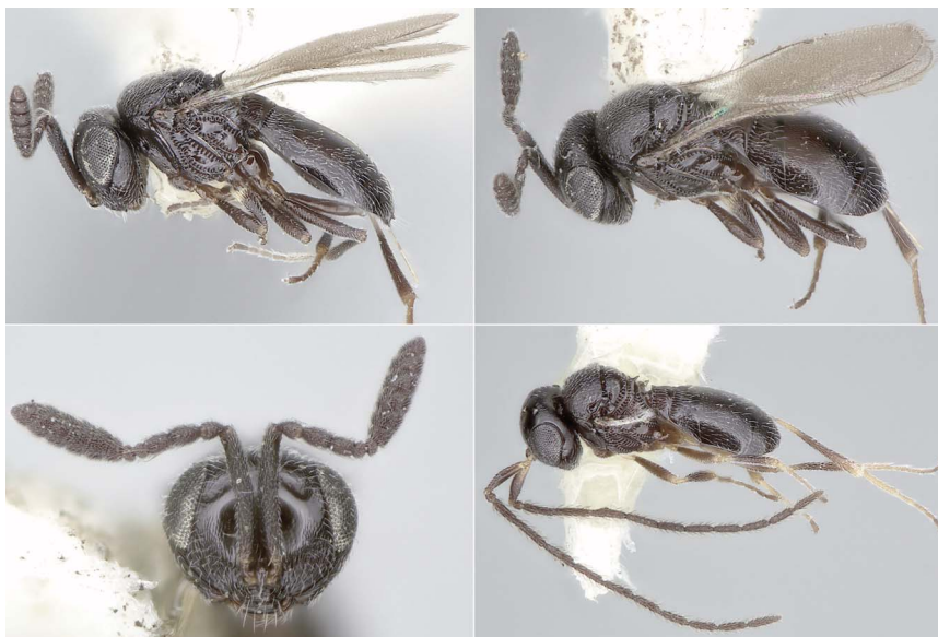
Figure 41. Trimorus lepidus (Hymenoptera: Scelionidae). Top left: female, lateral. Top right: female, oblique dorsal. Bottom left: female, face. Bottom right: male, lateral.

those here, so it may represent a fourth species. At least some species of Trimorus are known to be parasites of eggs of Carabidae (Fouts 1948), and these species may be having an impact on native Blackburnia , Mecyclothorax , or other native beetles.