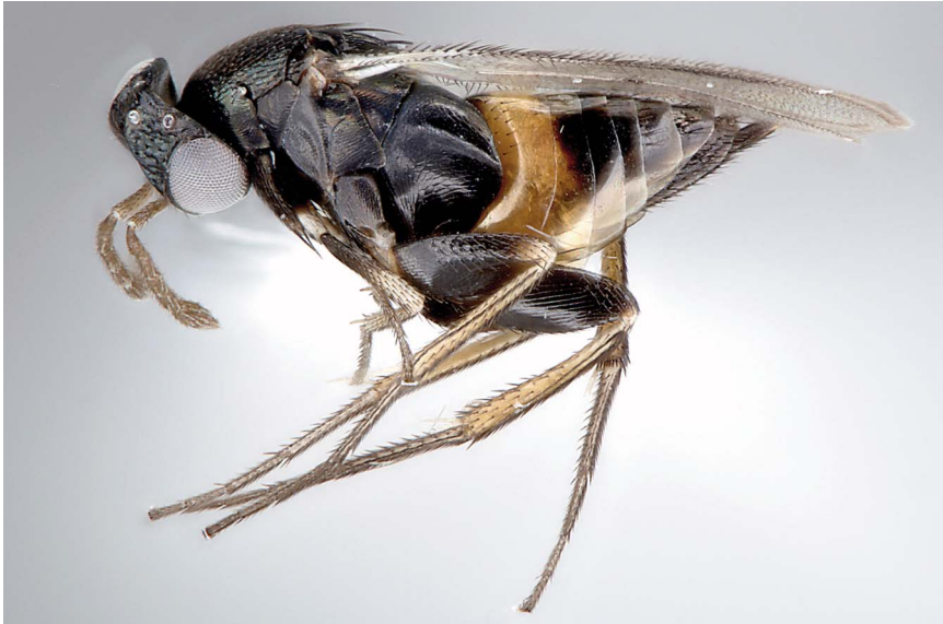
Figure 28. Elasmus sp. 3 (Hymenoptera: Eulophidae).

known Elasmus , E. atratus and E. polistis . Those recorded as “sp. A” and “sp. B” or “sp. 1” and “sp. 2” by Howarth et al. (2012) were reexamined and found to be male and female respectively of E. polistis ; however, the present species is assigned a different number in order to avoid confusion. It is closest to E. mandibularis Girault of Australia, but that species has the metasoma all dark. It is not any of the species described from North America, the Palearctic, or Australia (Burks 1965, Riek 1967, Graham 1995, Yefremova & Strakhova 2009, 2010, 2011, Gunawardene & Taylor 2012). It is probably an undescribed Australian species.