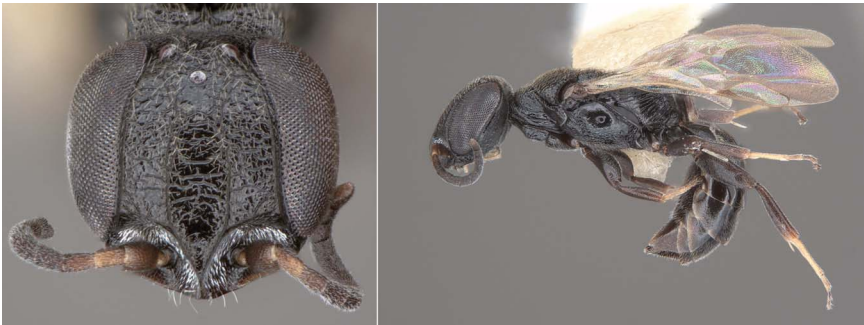
Figure 14. Nitela domestica (Hymenoptera: Crabronidae). Left: frontal view of head. Right: lateral habitus.

Material examined. O*AHU: Hawai'i Iloa Trail, on Diospyros sandwicensis , 22 Jul 2017, K.N. Magnacca, 1 ♀. UH Mānoa campus, sweeping Eucalyptus deglupta , 3 Feb 2025, K.N. Magnacca, 1 ♀.