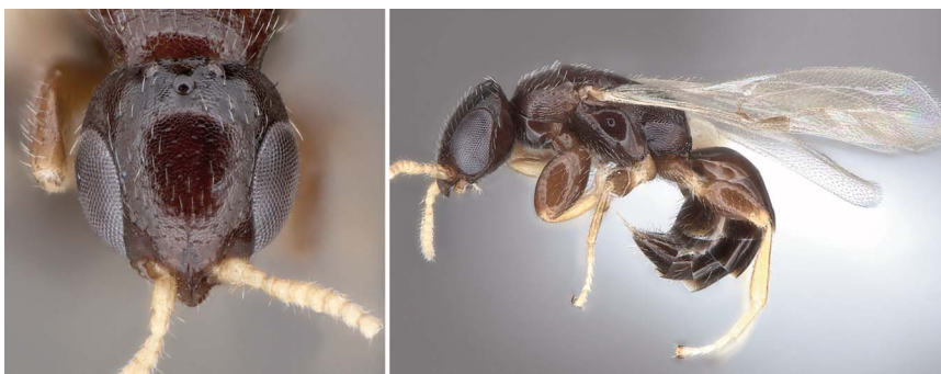
Figure 8. Goniozus williamsi (Hymenoptera: Bethyilidae). Left: dorsal view of head. Right: lateral habitus.

Material examined. KAUAI: Moloa[‘a], ex corn control plot, Aug 1990, P. Britt, 1♀. O‘AHU: Waimānalo, sweeping, 2 Aug 1988, J.W. Beardsley, 1♀. UH farm at Waimānalo, el. ca. 60–80 ft [18–24 m], sweeping crops & weeds, 5 Jun 1995, 1♀. Tantalus Drive, el. 1,500 ft [460 m], yellow sticky board trap, 12–27 May 1997, W. D. Perreira, 1♀. Round Top Drive, el. 900 ft [275 m], yellow sticky board trap, W.D. Perreira: 1♀ 10–16 Jun 1997, 1♀ 2–16 Sep 1997. Tantalus Drive, el. 1,600 ft [490 m], yellow sticky board trap, 22 Jul–5 Aug 1997, W.D. Perreira, 2♂. Tantalus, Nāhuina Trail, el. 1,200 ft [366 m], 5–19 Aug 1997, yellow sticky board trap, W.D. Perreira, 1♀. Waialua Farmlands, Trap 035 baited with BioLure, L. Leblanc: 2♀ 26 Sep–7 Dec 2004, 1♀ 24 Dec 2004–7 Jan 2005, UHIM. Pahole crest, 2,200 ft [670 m], 21.5393°N 158.1924°W, on Bidens torta , 28 Jul 2012, K.N. Magnacca, 1♀. Wai‘anae–Ka‘ala Trail, 2,400 ft [732 m], 21.5014°N 158.1566°W, on Alyxia stellata , 2 Nov 2012, K.N. Magnacca, 1♀. Pahole crest, 2,150 ft [655 m], 21.5374°N 158.1924°W, on Acacia koa , 1 Feb 2017, K.N. Magnacca, 2♀. MOLOKA‘I: Nr. Honomuni stream, el. 10 ft [3 m], yellow sticky board trap, 9–22 Dec 1995, J.W. Beardsley & W.D. Perreira, 1♀. MAUI: Nr. Pa‘akea Gulch, el. ca. 1,250 ft [380 m], yellow sticky board trap, 18 Nov–2 Dec 1995, W.D. Perreira, 1♀. Hanawī Stream, el. 1,040 ft [320 m], yellow sticky board trap, 18 Nov–2 Dec 1995, W.D. Perreira, 1♀.