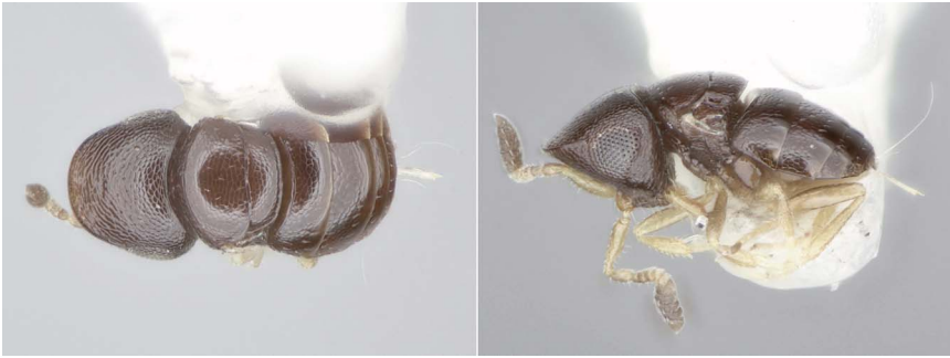
Figure 38. Encyrtoscelio mirissimus (Hymenoptera: Scelionidae). Left: dorsal view. Right: lateral view.