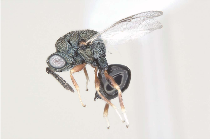
Figure 30. Chryseida bennetti (Hymenoptera: Eurytomidae).