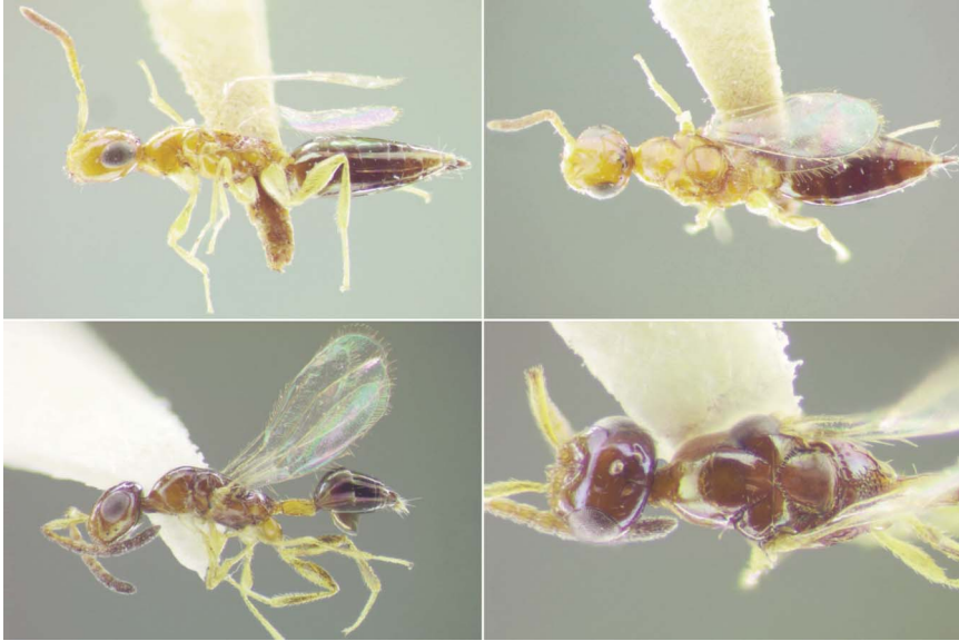
Figure 10. Laesthiola flavida (Hymenoptera: Cerocephalidae). Top left: Female, lateral. Top right: female, dorsal. Bottom left: male, lateral. Bottom right: male, dorsal.