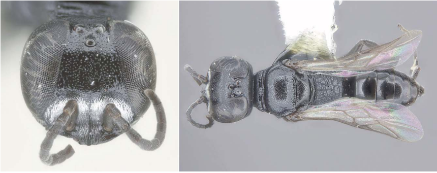
Figure 15. Nitela pendleburyi (Hymenoptera: Crabronidae). Left: frontal view of head. Right: dorsal habitus.