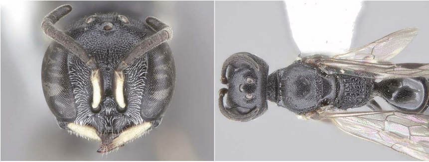
Figure 16. Passaloecus borealis (Hymenoptera: Crabronidae). Left: frontal view of head. Right: lateral habitus.