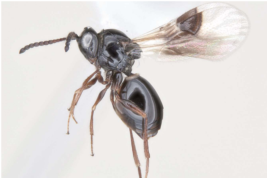
Figure 31. Trybliographa stigmata (Hymenoptera: Figitidae).