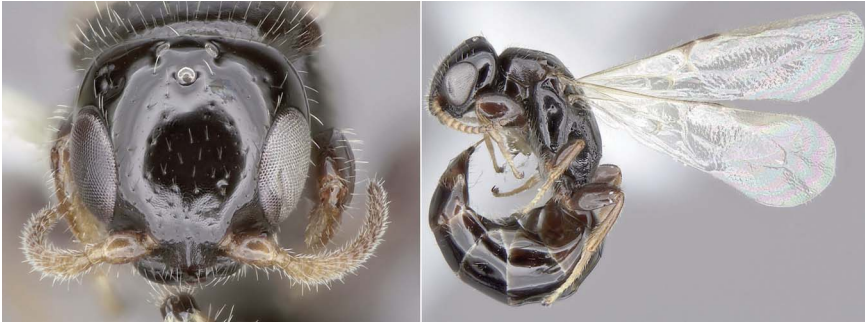
Figure 4. Goniozus aethiops (Hymenoptera: Bethylidae). Left: dorsal view of head. Right: lateral habitus.