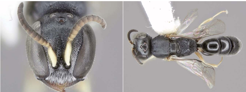
Figure 17. Polemistus pusillus (Hymenoptera: Crabronidae). Left: frontal view of head. Right: lateral habitus.

Material examined. O‘AHU: Wa‘ahila Ridge, N21°18.009' W157°48.416', Malaise trap, 21 July 1999, G.M. Nishida & R. Englund, 1♂ 2♀.