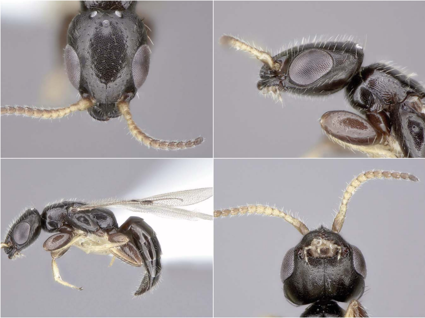
Figure 6. Goniozus foveolatus (Hymenoptera: Bethyliidae). Top left: dorsal view of head. Top right: lateral view of head. Bottom left: lateral habitus. Bottom right: ventral view of head, showing palpi. habitus.

the black mandible, obtuse clypeal apex in lateral view, and absence of the transverse propodeal carina (Fig. 6). In addition, it belongs to a large group of Nearctic Goniozus that have only four maxillary and two labial palpomeres as in Sierola , whereas most species in the genus (including all the others known from Hawai‘i) have the palpal formula 5/3.