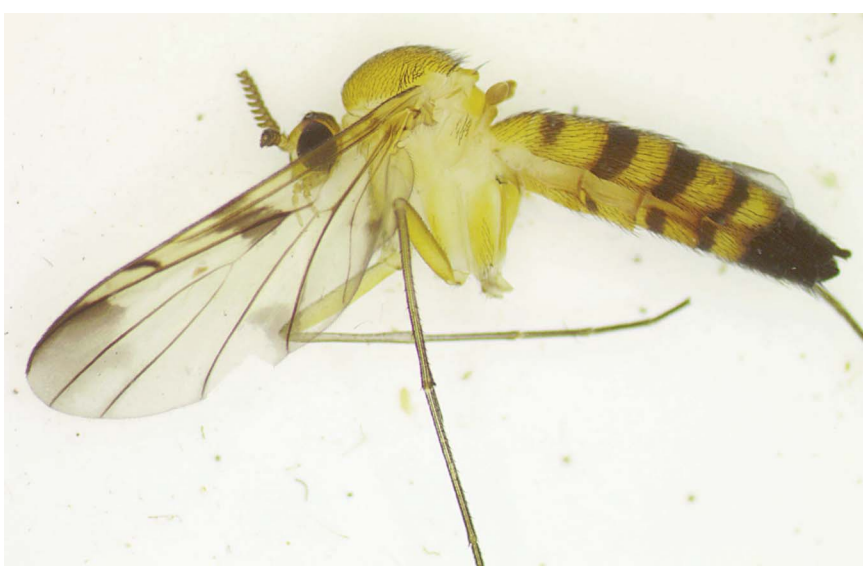
Figure 2. Proceroplatus sp. (Diptera: Keroplatidae).