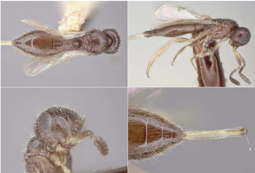
Figure 39. Paridris gorn (Hymenoptera: Scelionidae). Top left: dorsal habitus. Top right: lateral habitus. Bottom left: oblique frontal view of head. Bottom right: T3–6 and partially extruded ovipositor.

Kailua, coconut grove, el. 10 ft [3 m], yellow sticky board trap, 17 Dec 1994–2 Jan 1995, W.D. Perreira, 2♂. Kalaeloa NWR, site 3 Malaise trap, 22 Jun 2023, M. Ross & N. Chan, 1♂. LĀNA‘I: Lāna‘i, ex pitfall trap, Dec 1985, J.W. Beardsley, 1♂ 3♀.