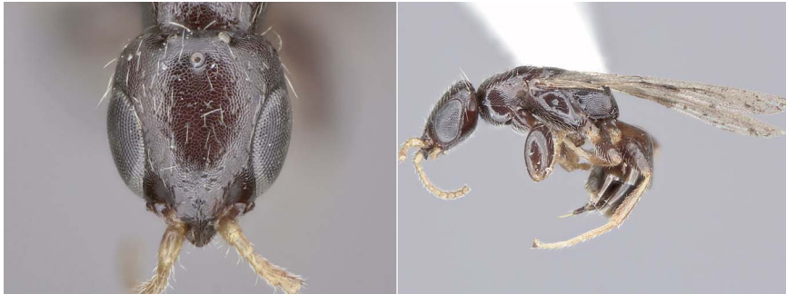
Figure 5. Goniozus floridanus (Hymenoptera: Bethylidae). Left: dorsal view of head. Right: lateral habitus.