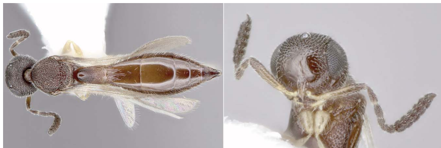
Figure 40. Probaryconus cauverycus (Hymenoptera: Scelionidae). Left: dorsal habitus. Right: oblique frontal view of head.

Material examined. O‘AHU: ‘Ewa, light trap, Jun 1955, 1♀. HAWAII: Kona, H.T. Osborn, 4♀. Chain of Craters Road nr. ‘Ālo‘i crater, 3,000 ft [915 m], 23 Jun 1966, J.W. Beardsley, 2♀.