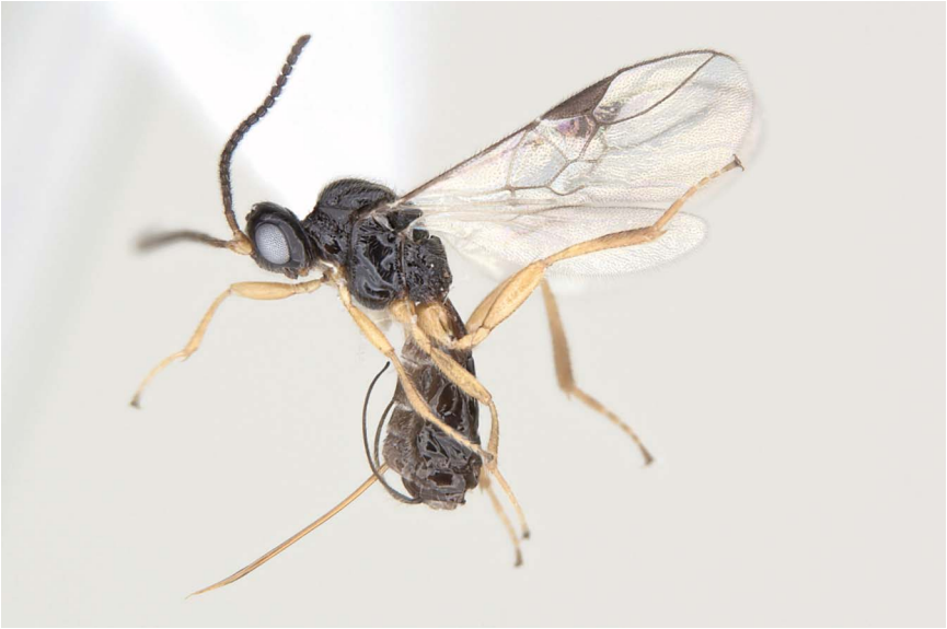
Figure 9. Blacus sp. (Hymenoptera: Braconidae).

14, 1♀. O‘AHU : Kaukonahua Road 225 m, on Corymbia citriodora , 21.5364°N 158.0885°W, 28 Feb 2025, K.N. Magnacca, 1♀. MOLOKA‘I : Kumu‘eli gulch 1,030 m, on ground, 21.0971°N 156.8692°W, 3 Jul 2024, K.N. Magnacca, 2♂. Kumu‘eli gulch 1,030 m, Malaise trap, 21.0971°N 156.8692°W, 3 Jul–20 Aug 2024, K.N. Magnacca, M24070310-01, 1♂ 1♀. MAUI : Launiupoko 760 m, Townes Malaise trap, 20.8582°N 156.5957°W, 19 Oct 2022–17 Mar 2023, K.N. Magnacca & K. Bustamente, M23031701-64, 3♂ 4♀.