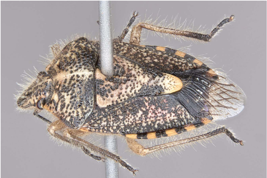
Figure 3. Agonoscelis puberula (Hemiptera: Pentatomidae).