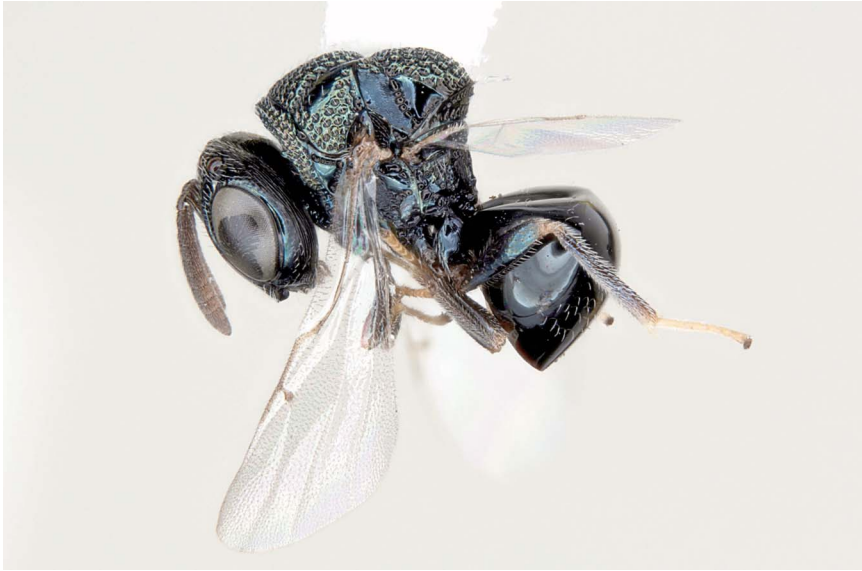
Figure 33. Perilampus chrysopae (Hymenoptera: Perilampidae).