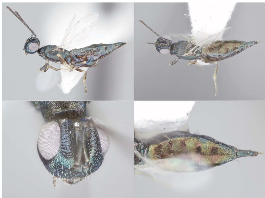
Figure 29. Eusandalum sp. (Hymenoptera: Eupelmidae). Top left: lateral habitus. Top right: oblique dorsal. Bottom left: frontal view of head. Bottom right: dorsal metasoma.