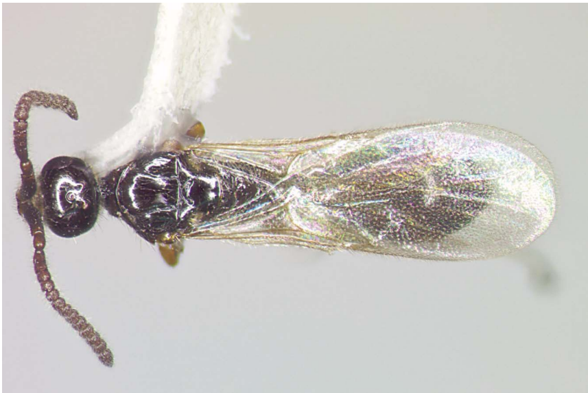
Figure 21. Belyta sp. nr. depressa (Hymenoptera: Diapriidae).

Material examined. KAUA'I: Alaka'i Swamp Trail, pitfall, Jul–Aug 1991, A. Asquith, 2♀. 'Alaka'i Trail, pitfall, Sep–Oct 1991, 1♂ 1♀. Alaka'i Swamp Trail, non-target study, 920220, 31 Jan–20 Feb 1992, 1♂.