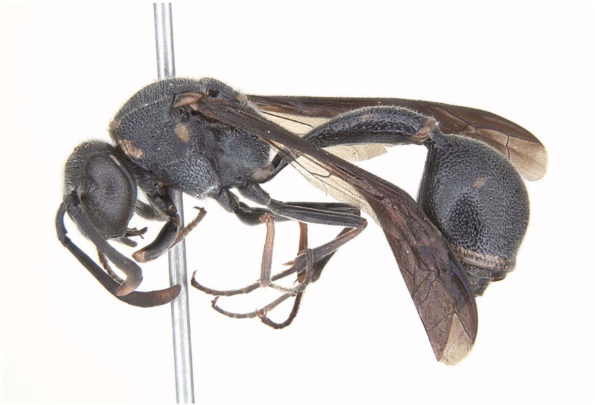
Figure 42. Eumenes punctatus (Hymenoptera: Vespidae).

philippinense . It is easily separated from all the Delta and Phimenes species by the coloration and the strong, close punctuation of the body, including the metasoma (Fig. 42). It is distinctly different from E. mediterraneus , introduced to Tahiti, which has the petiole broader and more abruptly expanded, and with much more extensive yellow marks. Although so far known from only a single specimen, it is likely established since it was found well into native forest.