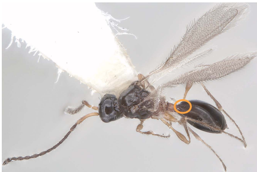
Figure 23. Entomacis mellipetiola (Hymenoptera: Diapriidae). Female, showing the 13-segmented antenna and deep notch in the syntergite (circled).

row, deep incision in the anterior margin of the syntergite (Fig. 23). This species is widespread throughout North America. The Hawai'i specimens clearly match the description and figures in Yoder (2004). On O'ahu and Maui it has been taken in the same sample with the following species, but is easily distinguished by the shorter petiole, lacking the tubular costal vein, having female F1–3 cylindrical rather than slightly expanded apically, and being slightly smaller overall. There are numerous other minute differences.