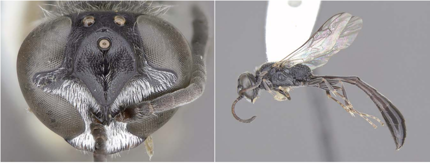
Figure 19. Trypoxylon melanurum (Hymenoptera: Crabronidae). Left: frontodorsal view of head, showing frontal enclosure. Right: lateral habitus.