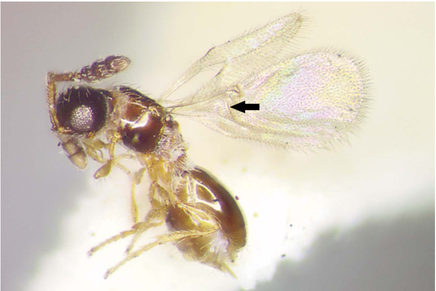
Figure 20. Basalys sp. (Hymenoptera: Diapriidae). Arrow indicates the basal vein.

This genus is distinguished by the combination of notauli absent, antenna with an abrupt 3-segmented club and the seven preceding flagellomeres small and nodiform, and the presence of a tubular, pigmented basal vein which is not connected to the submarginal vein as in Belytinae (Fig. 20). It superficially resembles Doliopria in the small size and strongly clubbed antenna, but in that genus the antenna is 11-segmented rather than 12 (only six nodiform segments between the pedicel and club), and the basal vein is absent. In addition to the specimens listed below, three specimens from O‘ahu and Moloka‘i have