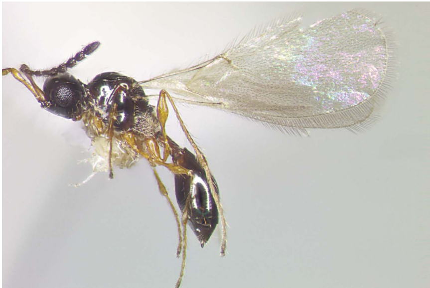
Figure 24. Entomacis cf. penelope (Hymenoptera: Diapriidae).

somewhat unusual in the genus. However, many undescribed species are known, and the Asian species are not as fully treated morphologically as those of the Nearctic.