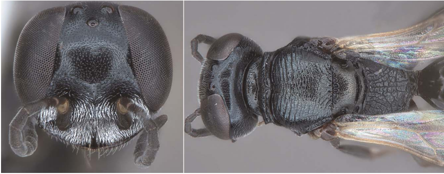
Figure 13. Nitela bicornis (Hymenoptera: Crabronidae). Left: frontal view of head. Right: dorsal habitus.

since it was found in the mid elevation forest, and due to its life history probably spends most of its time in the canopy where it would be rarely encountered.