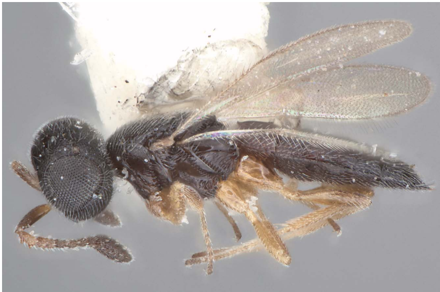
Figure 36. Cremastobaeus cf. boolei (Hymenoptera: Scelionidae).