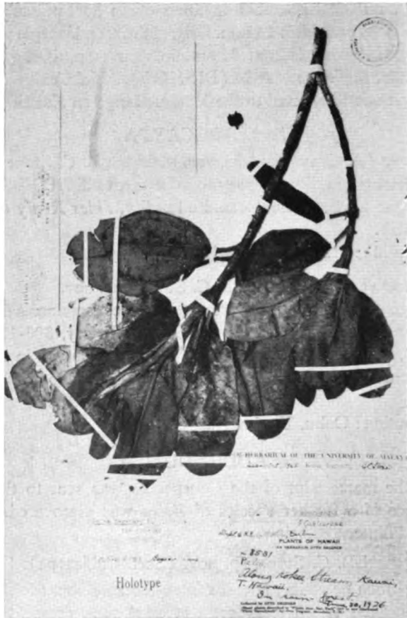
FIGURE 2.— Pelea Degeneri n. sp. Photo of holotype (Kauai: Degener 8531) in the Bishop Museum Herbarium.

made it clear that the above specimen represented a distinct new species, related to Pelea anisata , but with dense fulvous tomentum. Pelea waimeaensis has flattened, quadrate capsules, a feature that suggests a relationship to Pelea peduncularis ; while the capsules in Pelea Degeneri are cuboid.