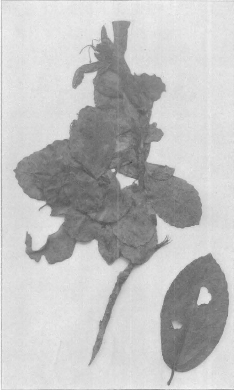
HIBISCUS KAHILII FORBES.