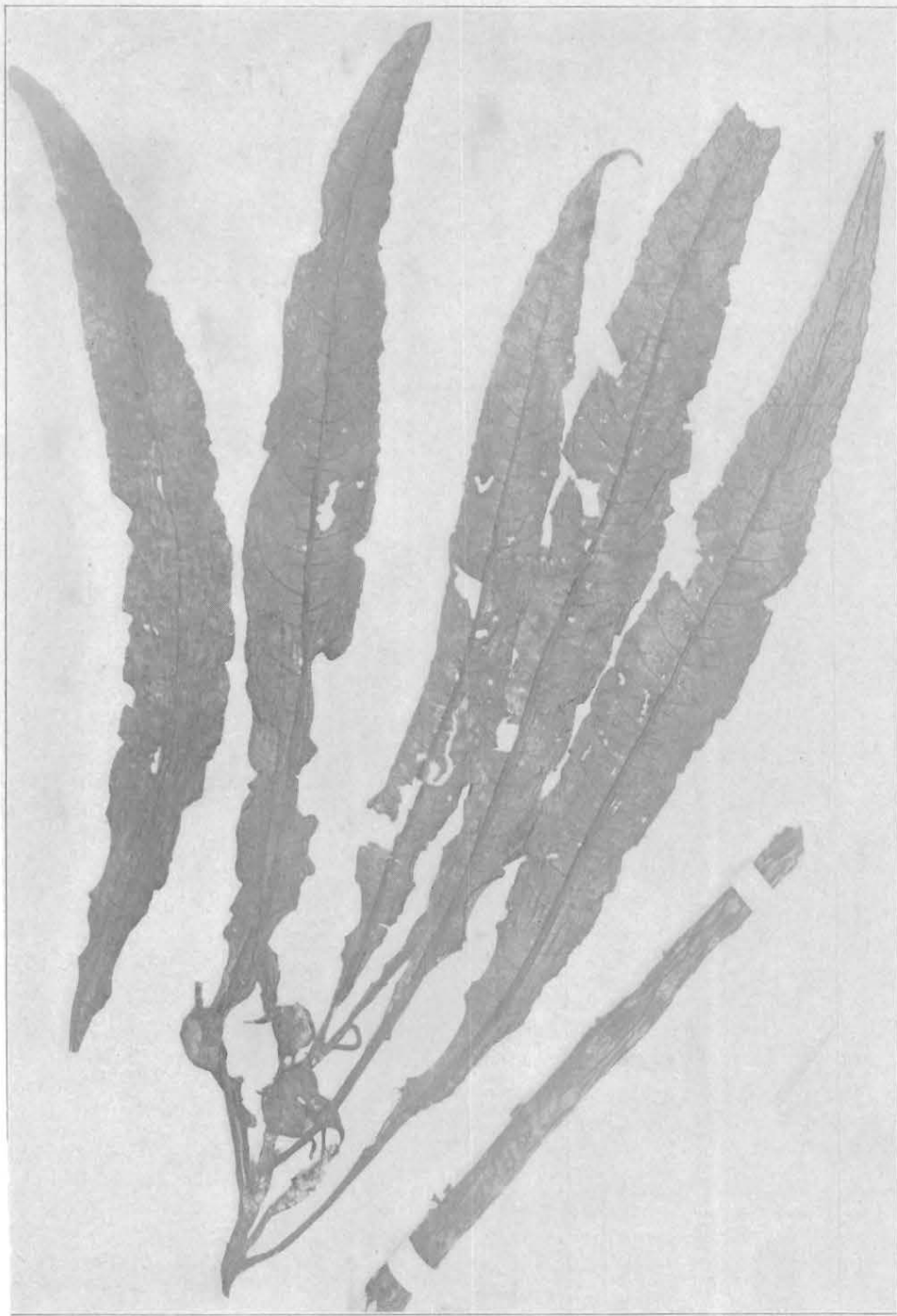
CYANEA UNDULATA FORBES.