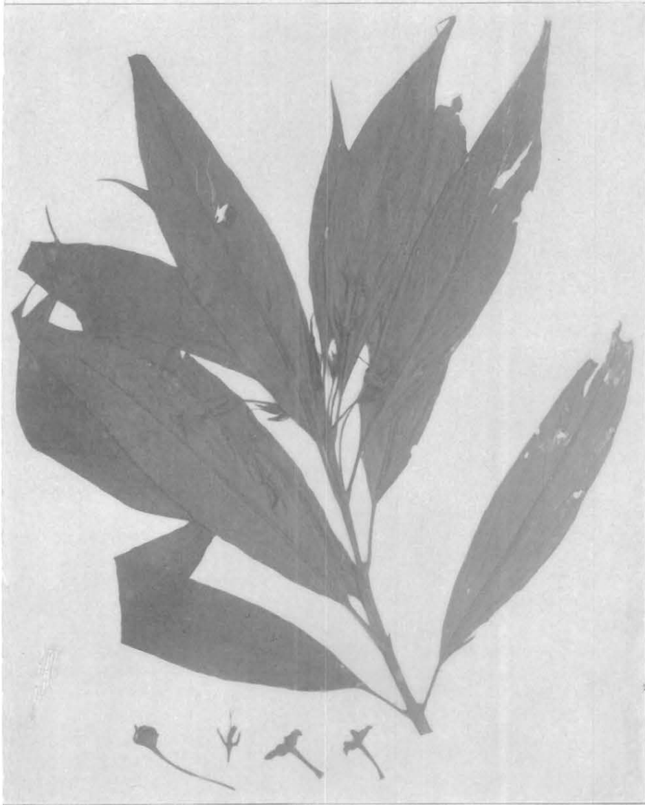
KADUA FLUVIATILIS FORBES.