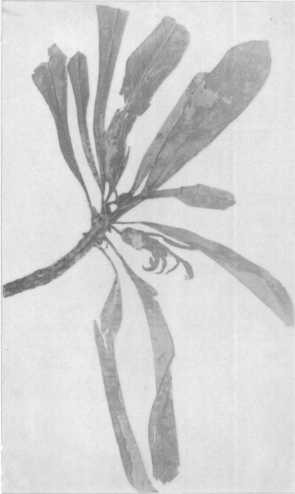
CLERMONTIA TUBERCULATA FORBES.