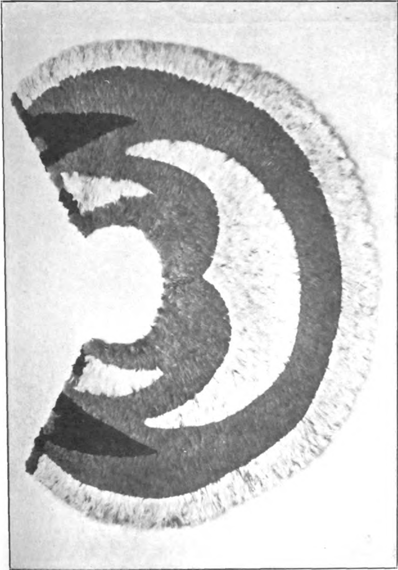
THE HOLMAN FEATHER CAPE.