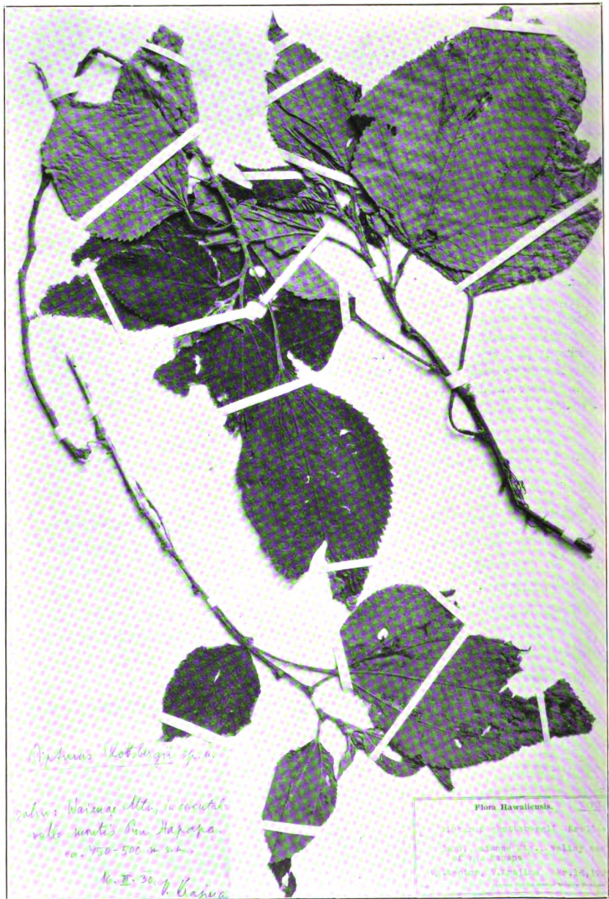
PLATE I. Pipturus skottsbergii Krajinna Type.