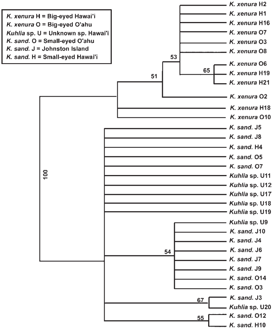
Figure 3. Maximum likelihood tree (manually rooted at midpoint) with bootstrap values (TVM+G model). Numbers at nodes indicate percent bootstrap support (of 100 replicates).

external primers for the heavy and light strands respectively; another general fish primer, L-431, was used to sequence the light strand internally. Initial sequences were examined and further primers were designed and renamed L431-Ku and Cyt b-HKu. A specific internal primer for the heavy strand was designed as well (H520). Subsequent sequencing used the L-14724 primer along with the three primers designed by the author. Cycle sequencing was conducted in 10 \mu l reaction volumes, which included 2 \mu l or 3 \mu l PCR product, 3.2 \mu l of 1 \mu M primer, and either 2 \mu l (light strand) or 3 \mu l (heavy strand) of Big Dye reaction premix. The reaction was carried out in one of three machines, depend-