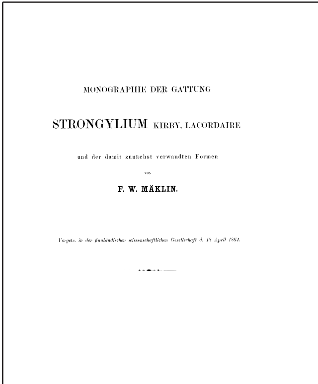
Figure 1. Title page for the journal version of Mäklin's " Monographie der Gattung Strongylium ".