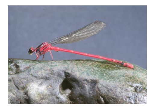
Pinao'ula (Megalagrion blackburni)