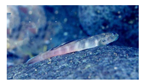
'O'opu hi'ukole (Lentipes concolor)

The major concern from an aquatic ecosystem perspective would be that weed control needs to be strong in the patches were koa is logged. This would ensure strawberry guava does not replace the mature koa that has just been logged. Aquatic biota would be adversely impacted if invasive weed species become established because they are not adapted to heavily sedimented water conditions. To ensure buffer zones are maintained and that invasive species do not gain a foothold in areas where koa is selectively logged, it is recommended that forest regeneration is monitored for the life of the project by a botanist or forester with experience in native Hawaiian rainforest ecosystems. It is also recommended that aquatic habitats and aquatic biota be monitored for the life of the project to ensure logging does not increase rates of sedimentation that would adversely impact native aquatic biota.