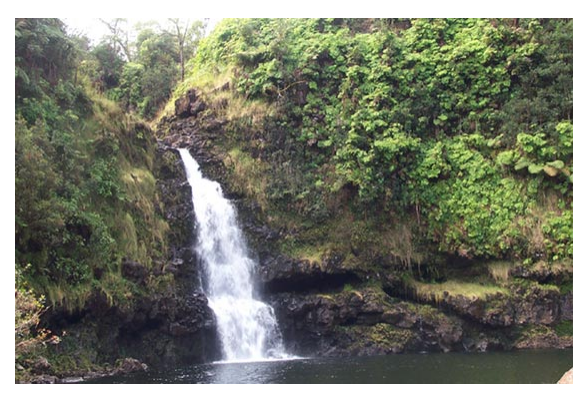
Falls at Honoli'i Stream, 1760 ft. elevation

Aquatic insects were by far the most species-rich group found in the study area, with 56 species collected (Table 1), and numerically were also the most abundant group. Figure 2 represents the total number of species found for each major aquatic taxa observed in study area streams. The native or nonindigenous status of arthropods was ascertained from Nishida (2002). Nonindigenous aquatic species have been brought into Hawai'i both accidentally and intentionally, and now comprise a major portion of aquatic biota found in many Hawaiian streams.