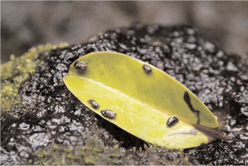
Figure 1. Erinna newcombi in Hanakoa.