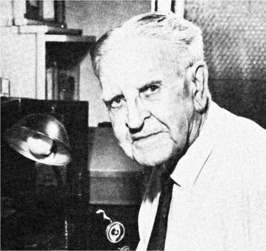
Charles Howard Edmondson (1876–1970).