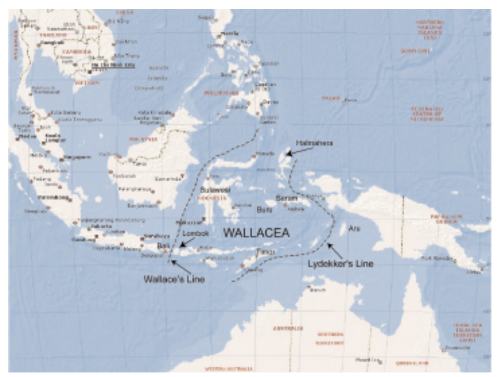
Figure 2. The biogeographic region of Wallacea, bounded by Wallace's Line in the West and Lydekker's Line in the East.

Four glaciation periods have been recorded during the late Quaternary and these resulted in climatic oscillations, ecological differentiation and periods of geographical isolation, leading to considerable speciation in the forests (Webb & Tracey, 1981).