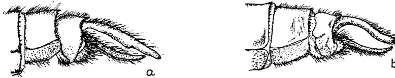
FIGURE 1. Hemicordulia , male appendages: a , H. oceanica ; b , H. mumfordi . Drawn by G. T. Lew.

Hemicordulia mumfordi , new species (fig. 1, b ).