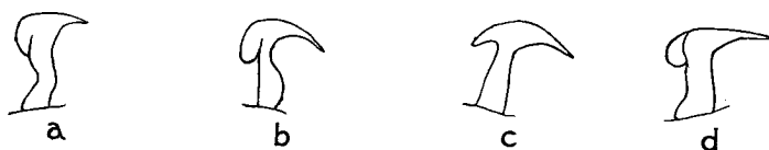
FIGURE 3.— Nabis species, left male hamus: a, N. longipes Van Duzee; b, N. plicatus Van Duzee; c, N. ancora , new species; d, N. mumfordi Van Duzee.

Uapou: Teavaituhai, Paaumea side, altitude 3020 feet, November 20, 1931, 1 specimen; Tekohepu Summit, altitude 3200 feet, November 28, 1931, at light, 1 specimen; Teavanui Pass, altitude 2900 feet, November 30, 1931; LeBronnec.