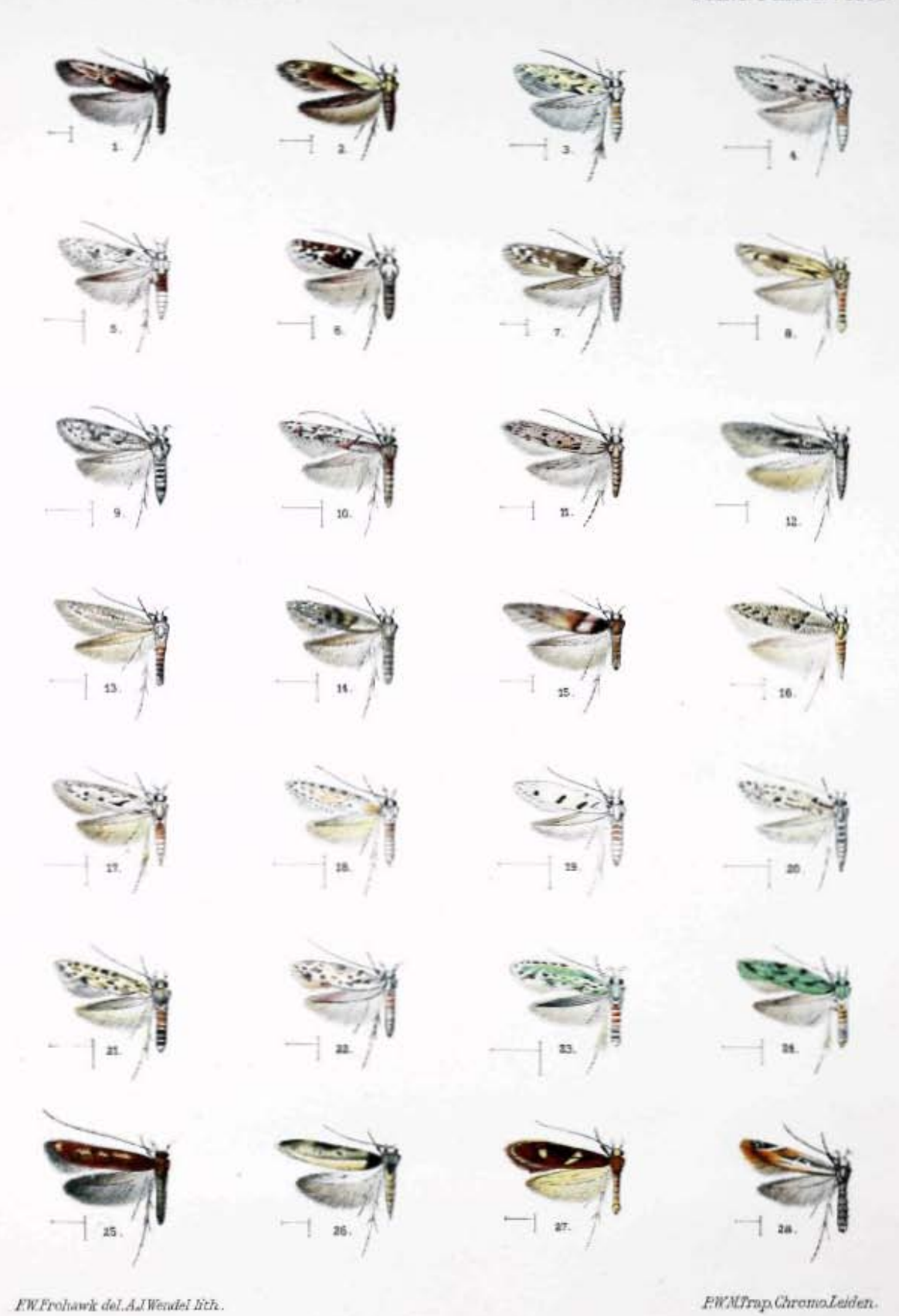
Lord Walsingham. Microlepidoptera.