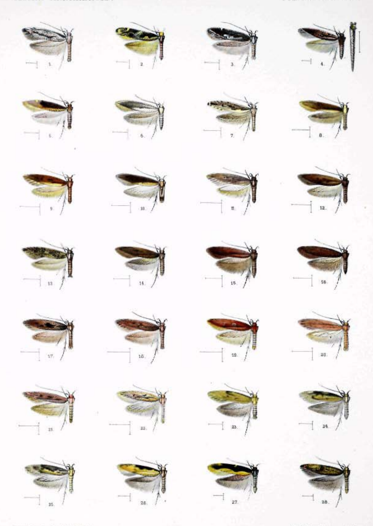
FW.Frchawk del.AJ.Wendel lith.