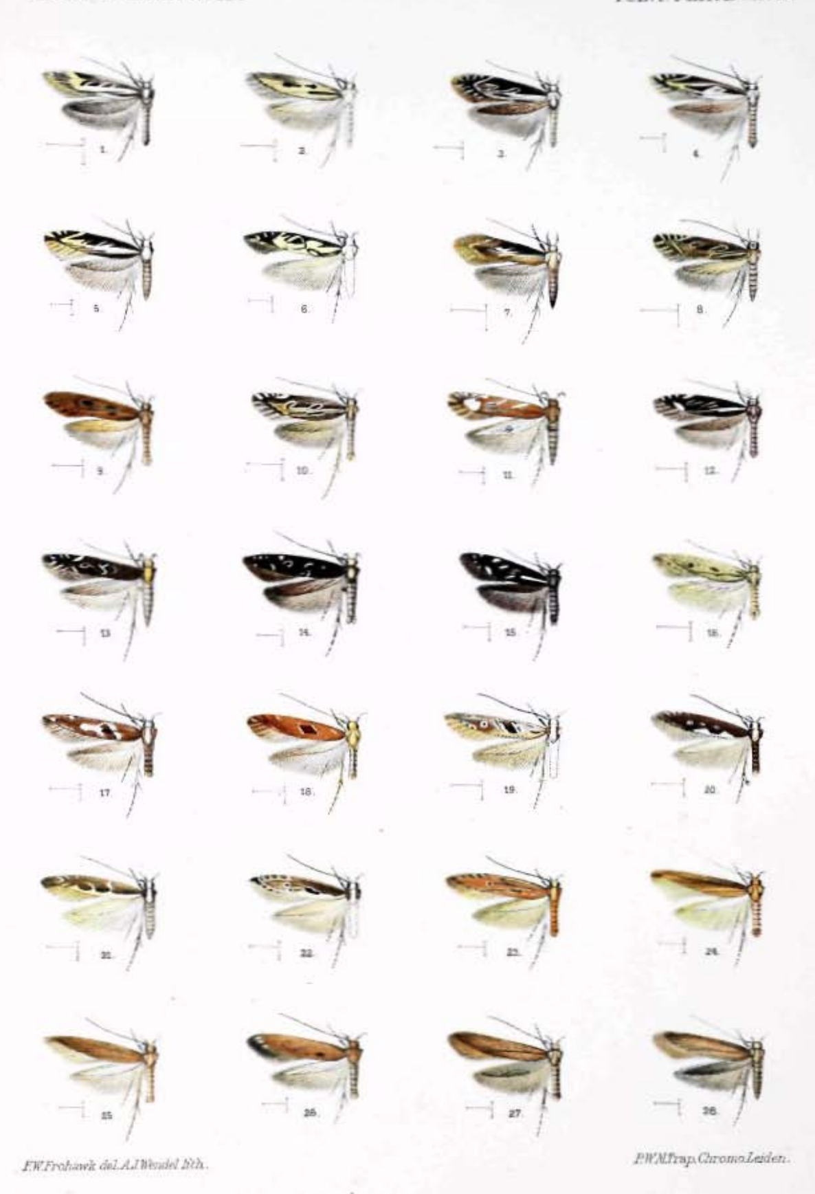
Lord Walsingham Microlepidoptera.