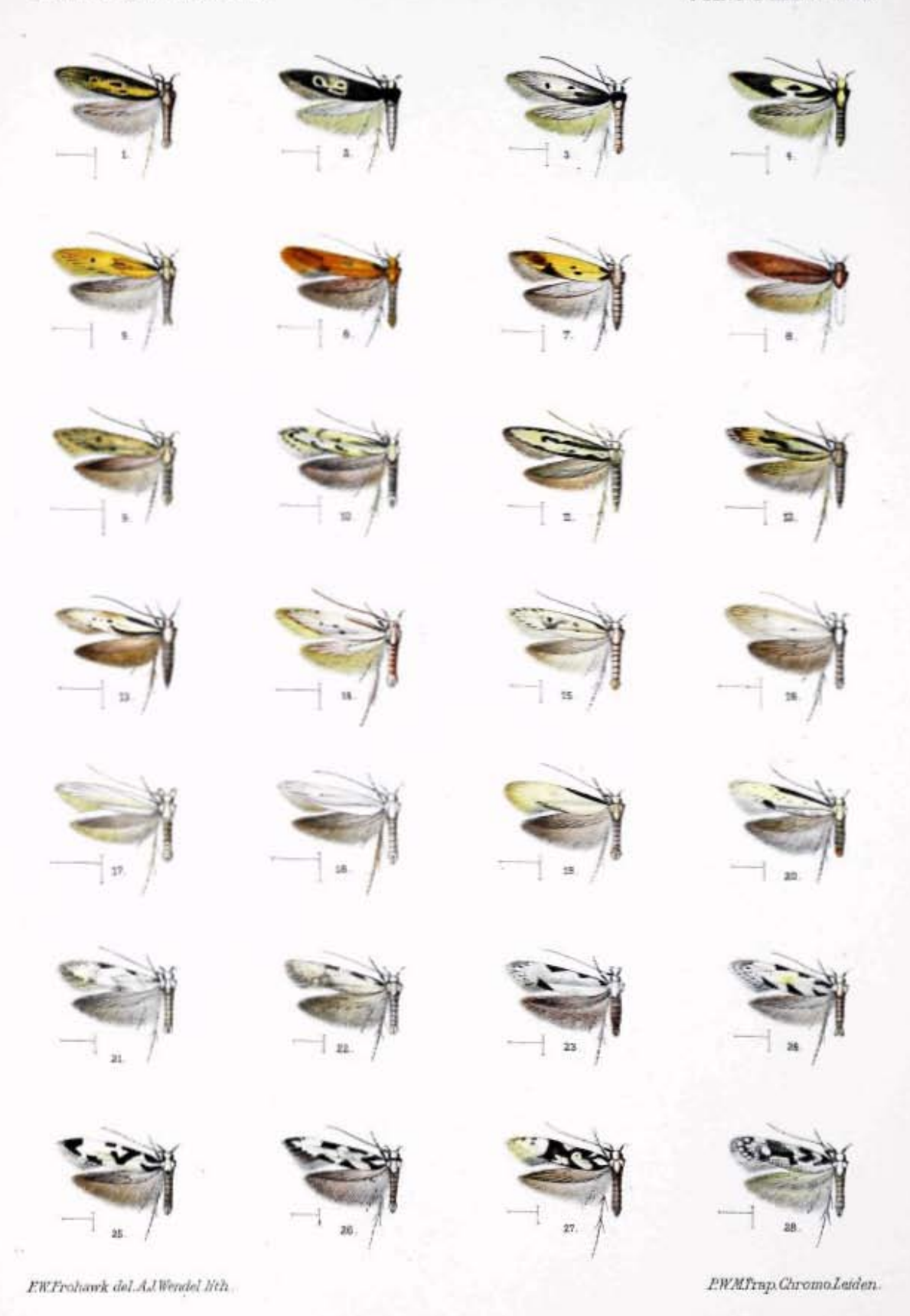
Lord Walsingham. Microlepidoptera.