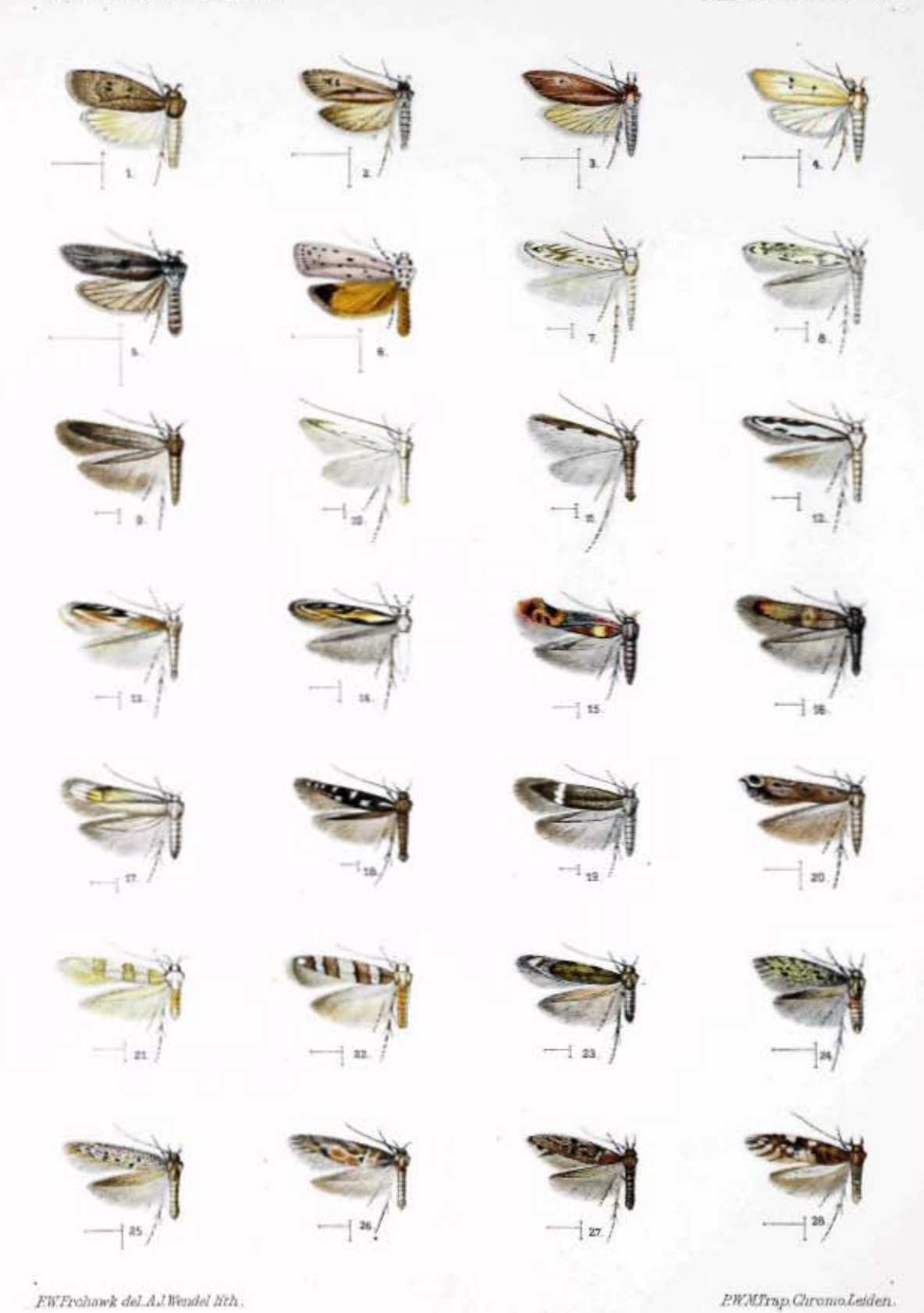
Lord Walsingham. Microlepidoptera.