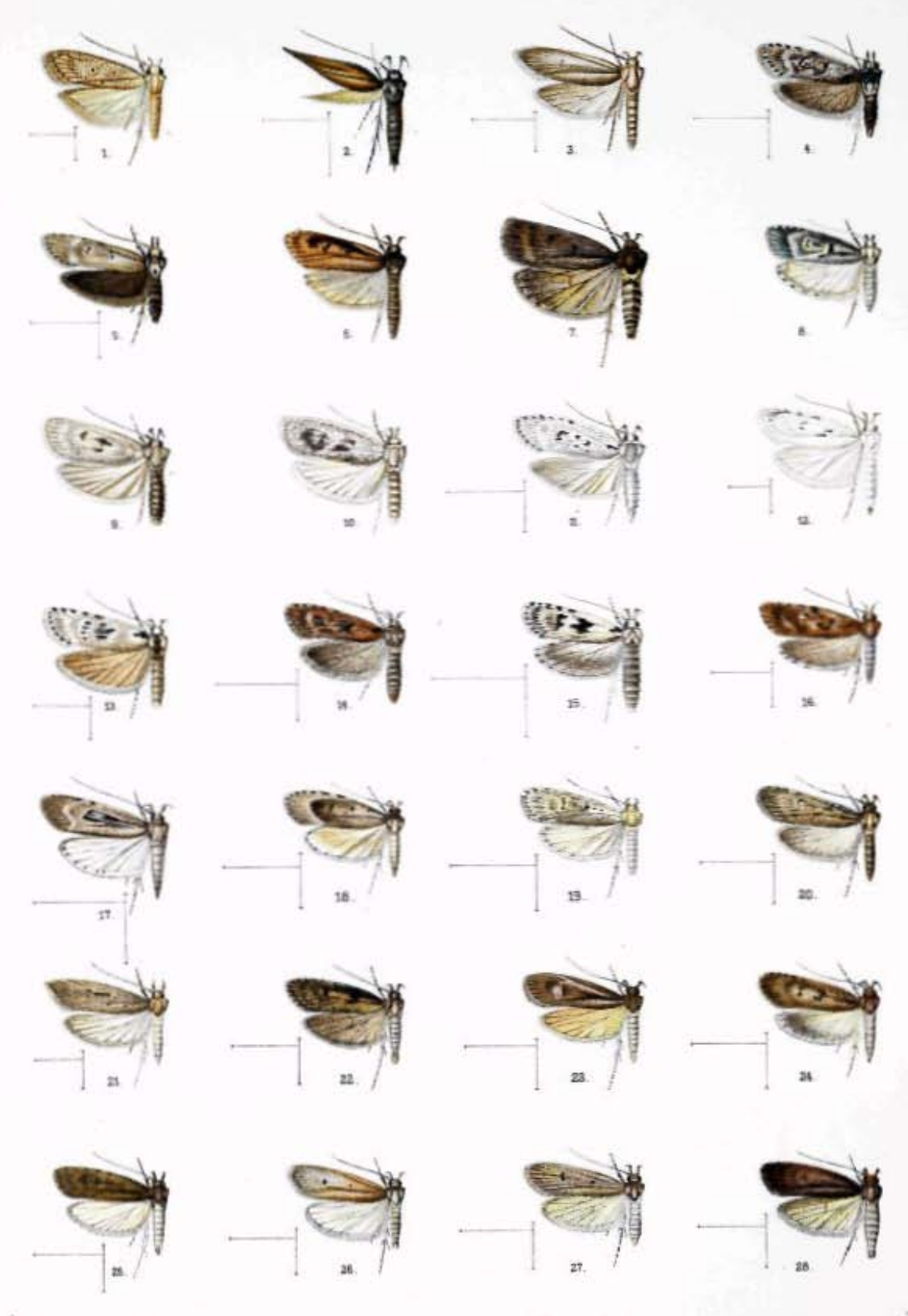
EW Erohawk del. A.l. Wendel. lith.