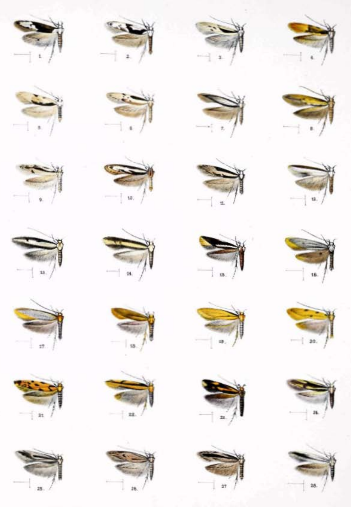
EWFrohawk del.AJ.Wendel lith.