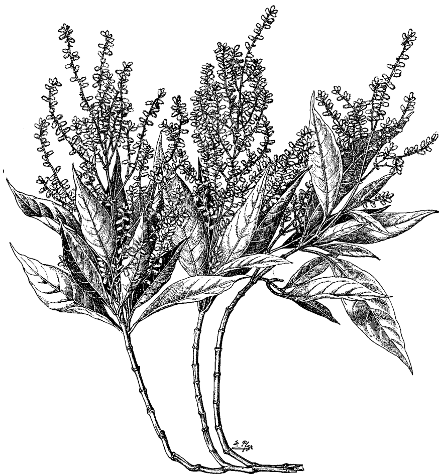
FIGURE 1.— Achyranthes mangarevica Suessenguth. Habit.

A. arborescens is found only in Norfolk Island; A. marchionica F. Brown in the Marquesas Islands; and A. mangarevica at the present time only in Mangareva. Without doubt these three species are