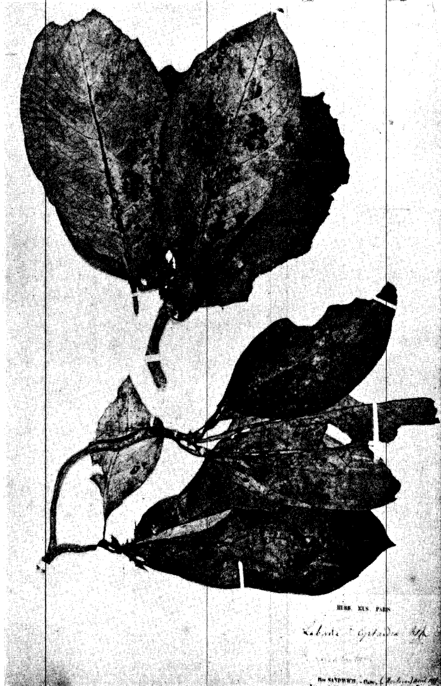
PLATE 1.— Labordia Cyrtandrae , from type specimen, J. Remy 358 bis.