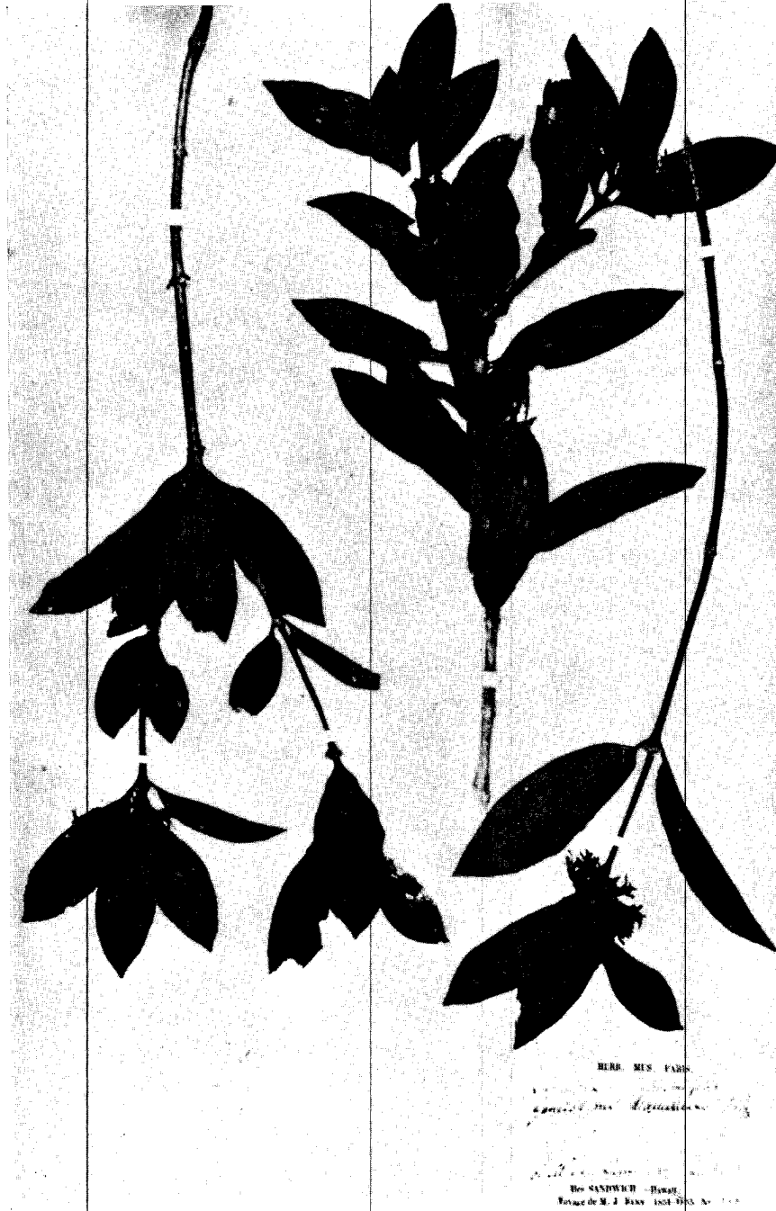
PLATE 2.— Labordia hedyosmifolia , from type specimen, J. Remy 352.