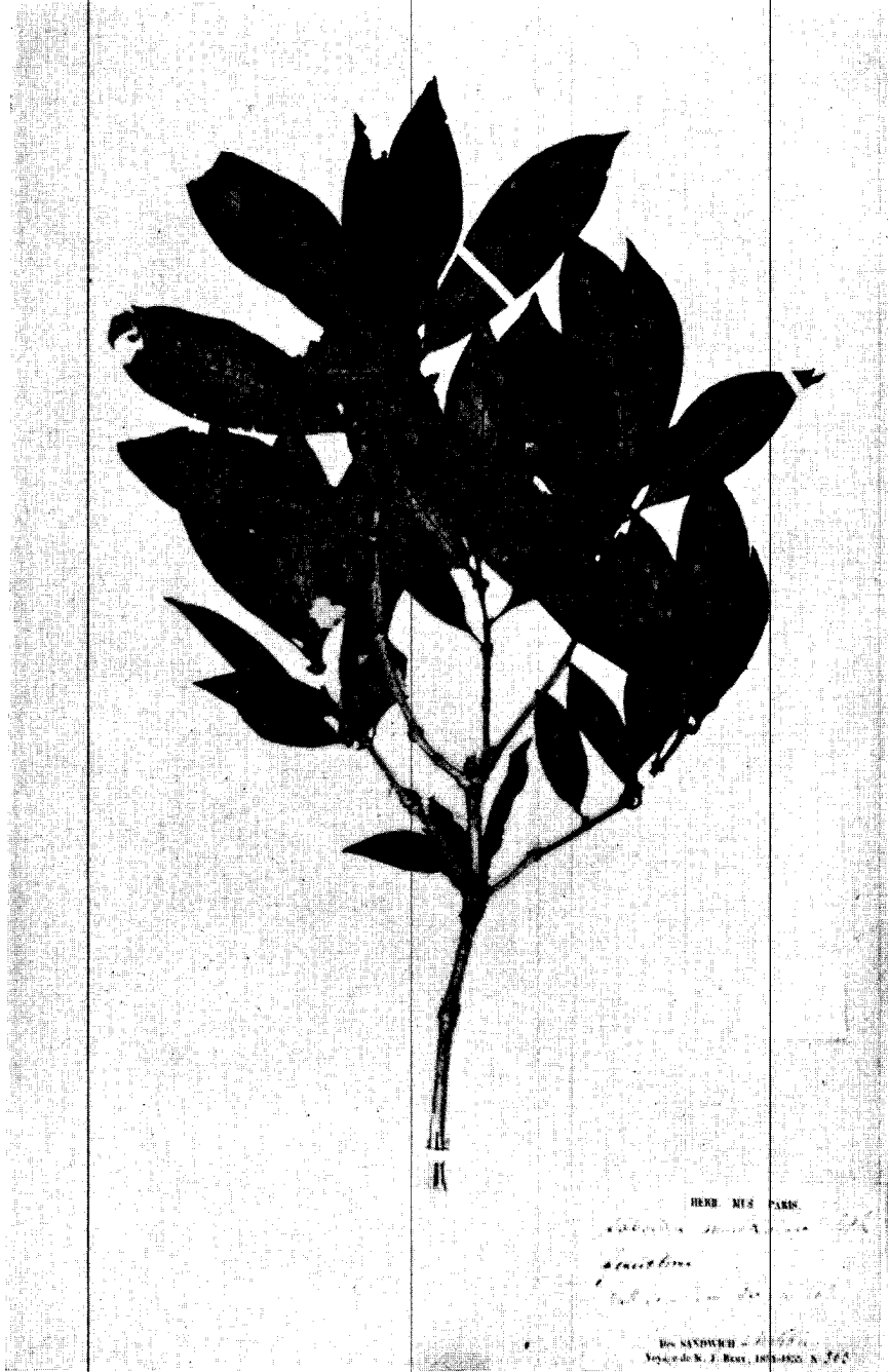
PLATE 3.— Labordia molokaiana , from type specimen, J. Remy 363.