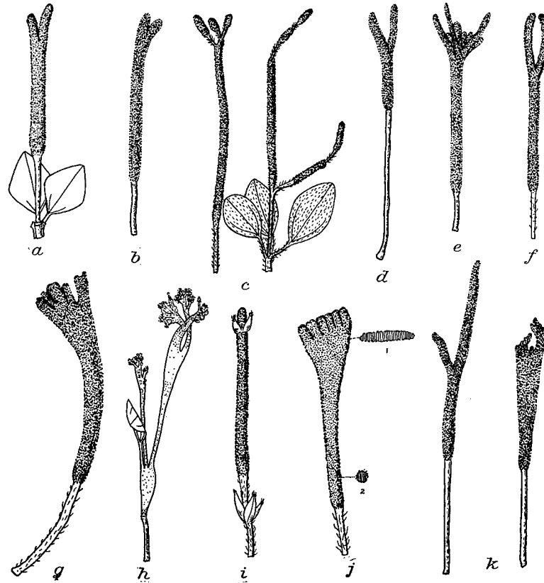
FIGURE 1.—Abnormalities in Peperomia : a , P. reflexa ; b , P. Gibbonsii ; c , P. expallescens ; d , P. mauiensis ; e , P. rhomboidea variety rarotongana ; f , P. lilifolia ; g , P. sandwicensis ; h , P. pallida variety rurutensis ; i , P. Cookiana variety flavinerva ; j , P. hirtipetiola ; k , P. hendersonensis .

Secondary spikes arising as branches from the peduncle of the primary spike similar to that shown in figure 2, a .