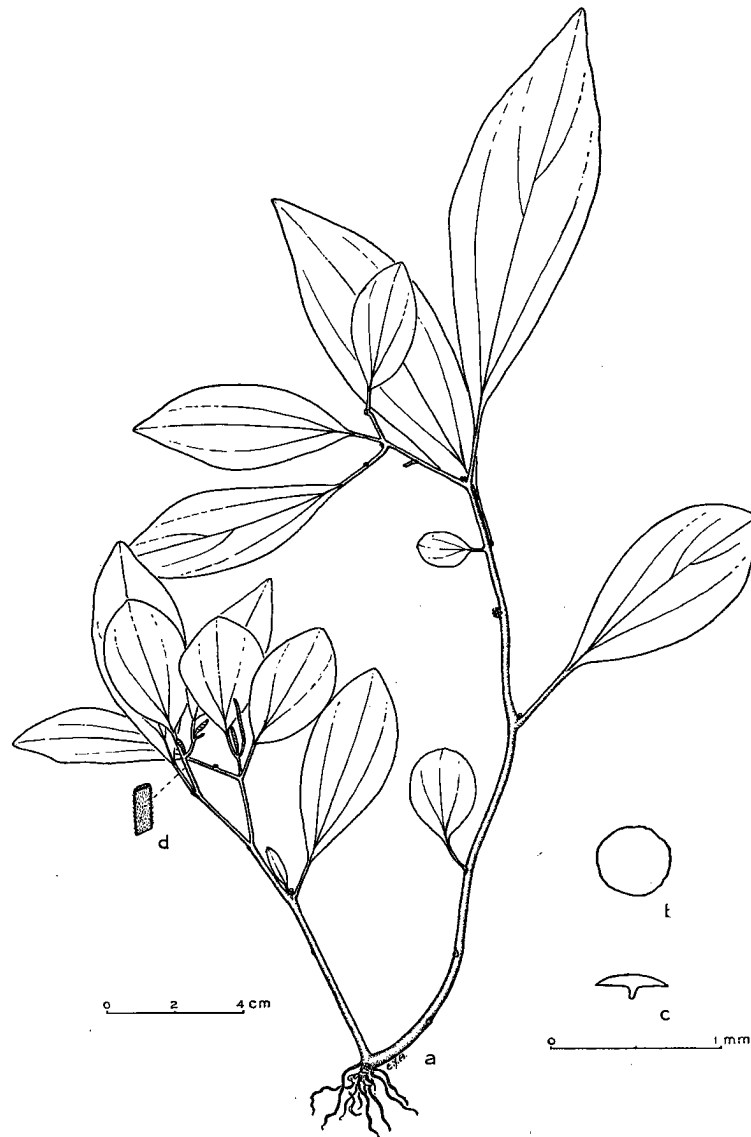
FIGURE 2.— Peperomia haukuensis : a, habit; b, top of bract; c, profile of bract; d, stem, enlarged.