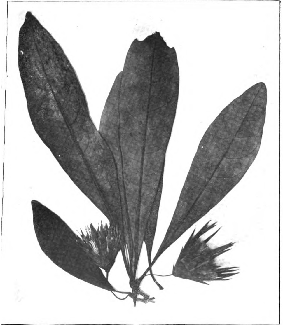
HESPEROMANNIA LYDGATEI FORBES.