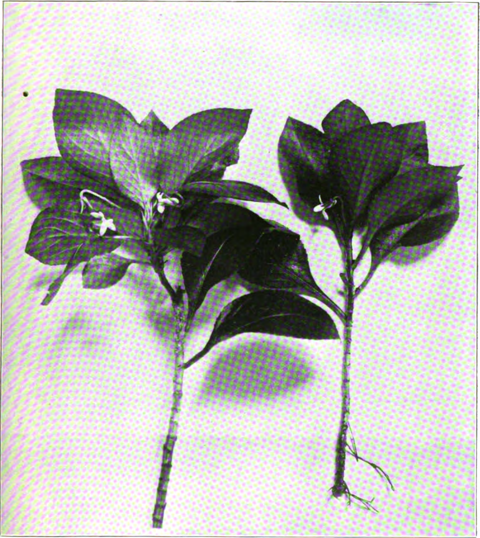
VIOLA OAHUENSIS FORBES.