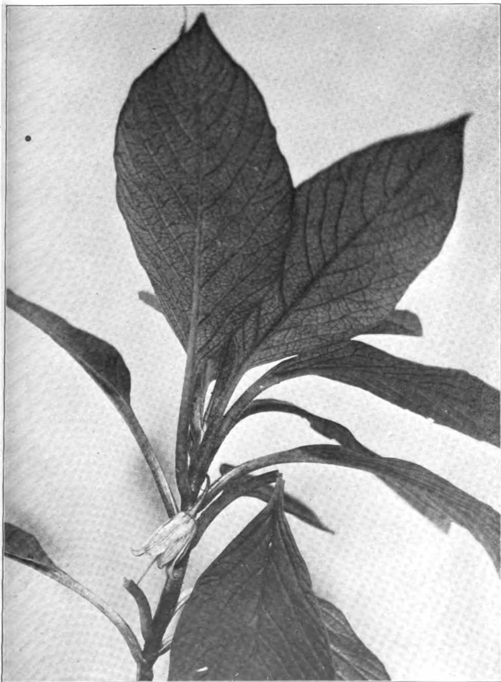
LYSIMACHIA LONGISEPALA FORBES. FRUITING STAGE.