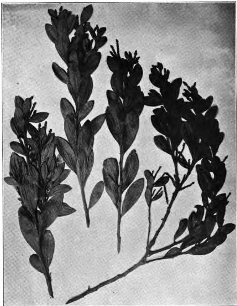
EXOCARPUS LUTEOLUS FORBES.