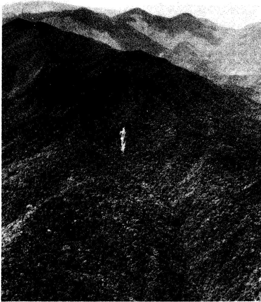
Figure 2. Dissected ridge system of Mt. Dayman, typical of the collecting localities of this expedition.