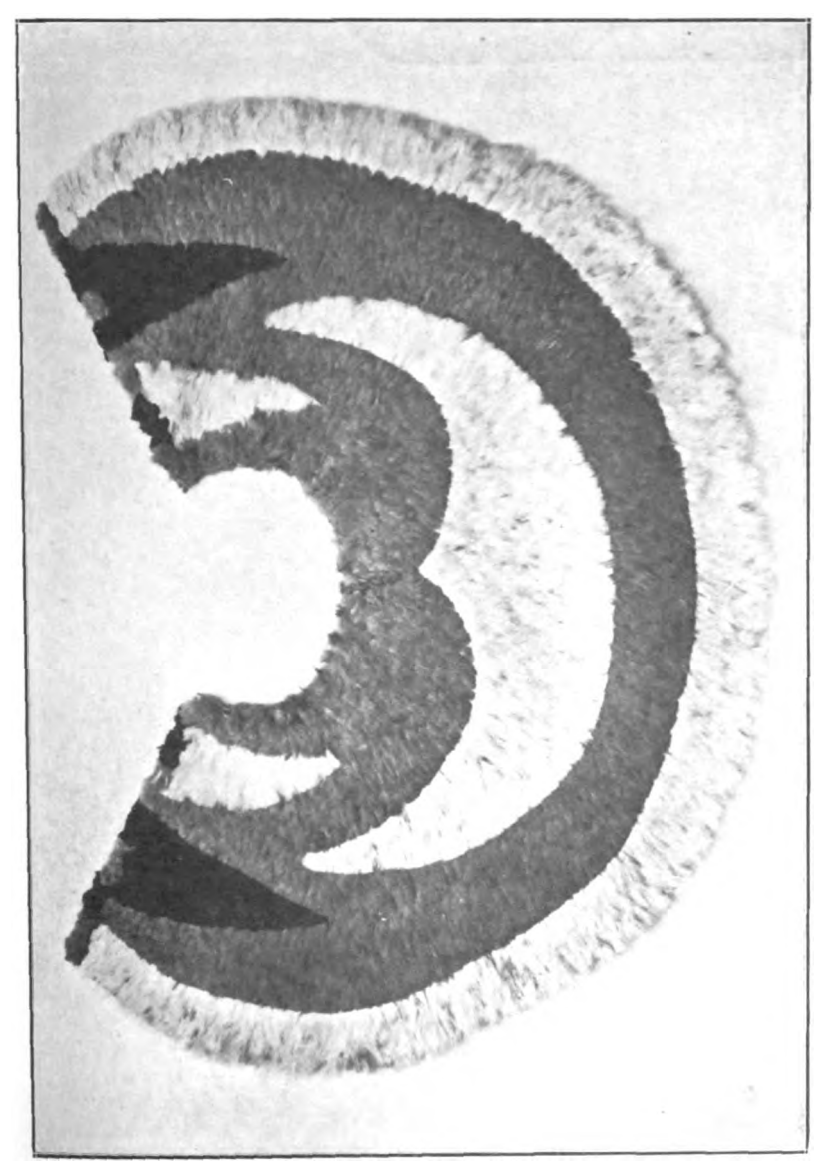
THE HOLMAN FEATHER CAPE.