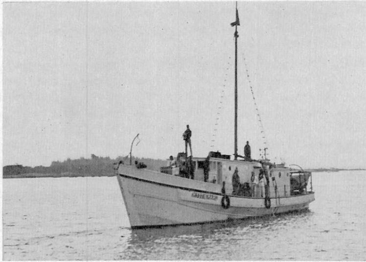
THE MYOJIN MARU, OR ISLANDER, AS SHE HEADED OUT TO SEA.

and the ability to withstand sudden violent winds are essential. As a ship designed to meet these requirements, the Myojin Maru , renamed the Islander , was chartered. It was a converted sampan 87 feet long with a gross tonnage of 75 tons and a draft of 6 feet, equipped with a 200-horsepower Diesel engine and a radio.