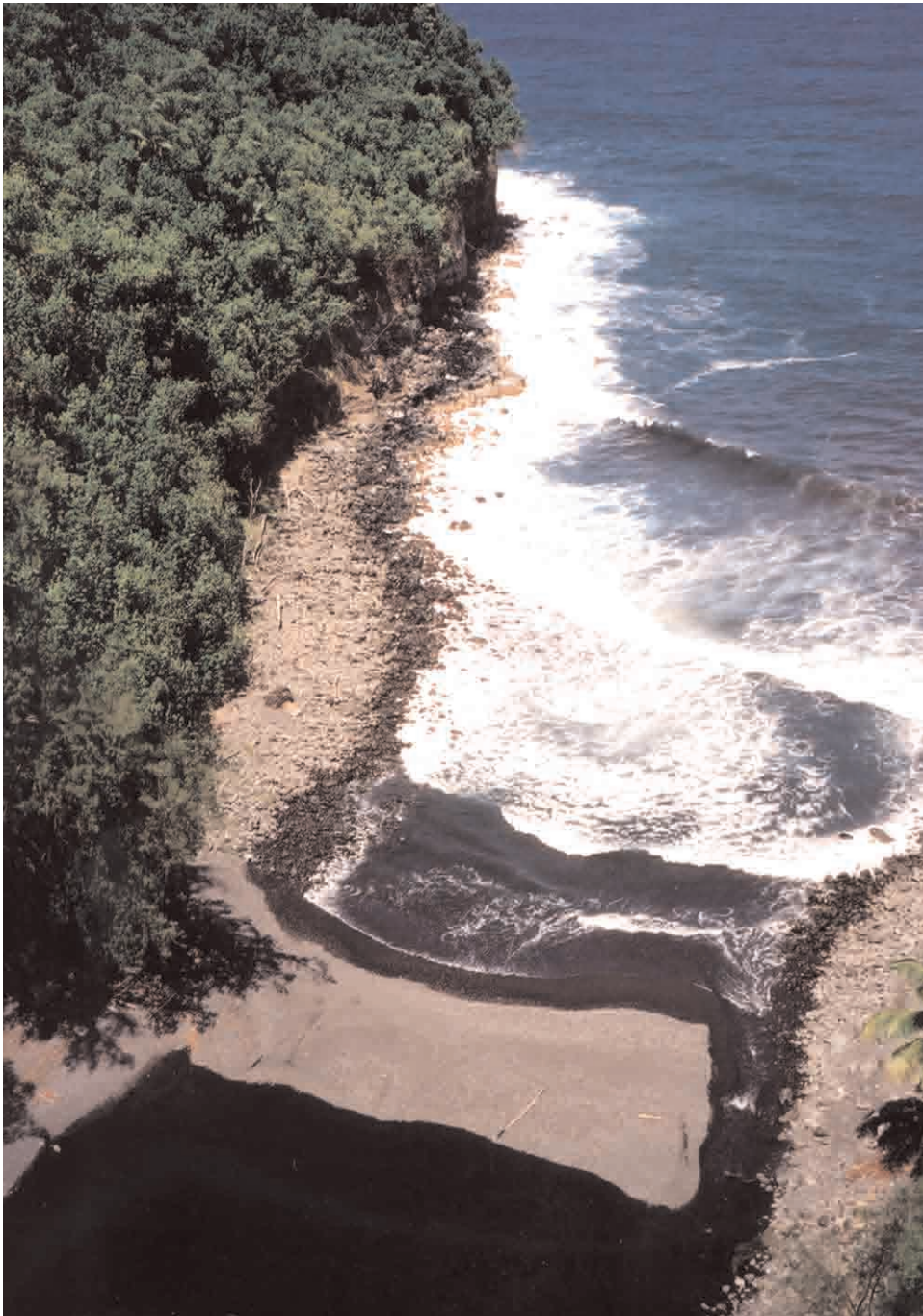
Figure 1. Overview of the mouth of our study site, Hakalau Stream, Hawai'i.