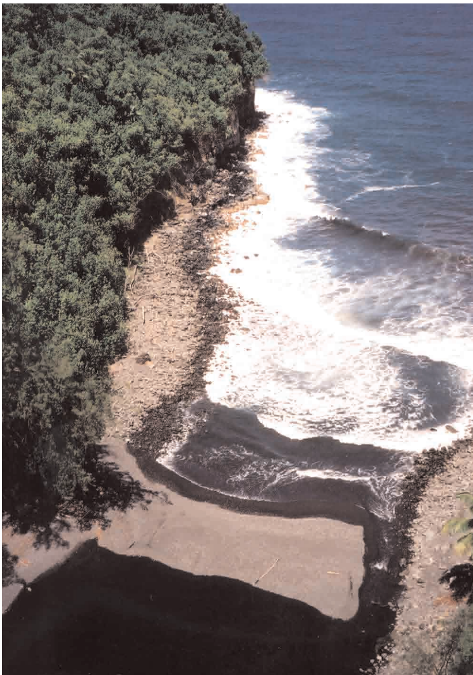
Figure 1. Overview of the mouth of our study site, Hakalau Stream, Hawai'i.